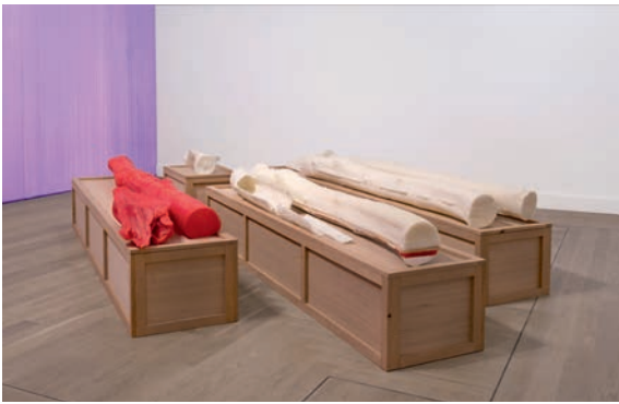
Thu-Van Tran, The Red Rubber , 2017 View of the exhibition at Moderna Museet, Stockholm, 2017.