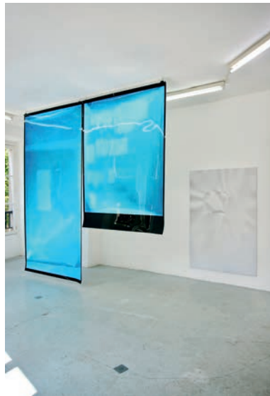
Thu-Van Tran, Air and Dreams #1 & #2 , 2017 View of the exhibition at Galerie Joseph Tang, Paris, 2017