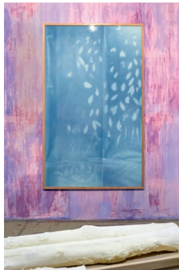
Thu-Van Tran, In the Fall, in the Rise; Penetrable; The Red Rubber (detail), 2017 View of the exhibition "Viva Arte Viva", Biennale di Venezia, 2017.