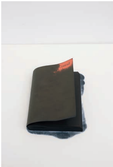
Thu-Van Tran, Without Stain #1 (détail), 2012 Courtesy of the artist and Meessen De Clercq, Brussels