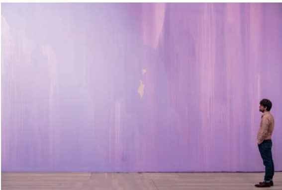
Thu-Van Tran, Penetrable , 2017 View of the exhibition at Moderna Museet, Stockholm, 2017