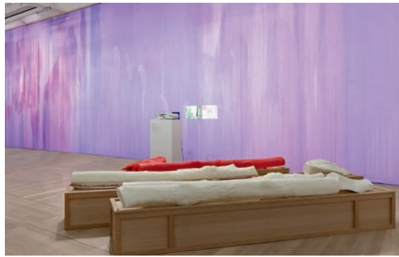
Thu-Van Tran, The Red Rubber; Penetrable , 2017 View of the exhibition at Moderna Museet, Stockholm, 2017.