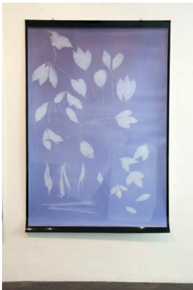
Thu-Van Tran, Au Couchant Fordlandia , 2015