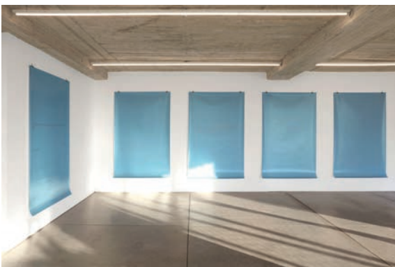
Thu-Van Tran, We live in the flicker , 2016 View of the exhibition at Ladera Oeste, 2016.