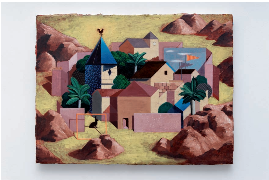
Small Desert Settlement , 2011 tempera oil on linen 46 x 60,5 cm