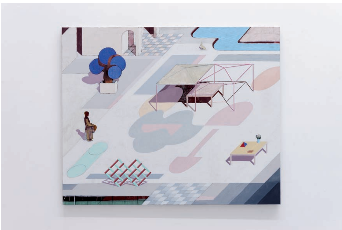
Canopy , 2012 oil tempera on linen 143 x 175 cm