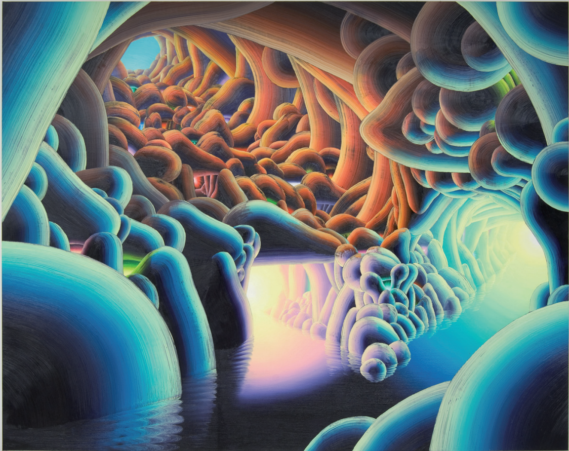
Desert Hole 2 (second version) , 2007 oil on canvas 199 x 250,4 cm Collection MUDAM