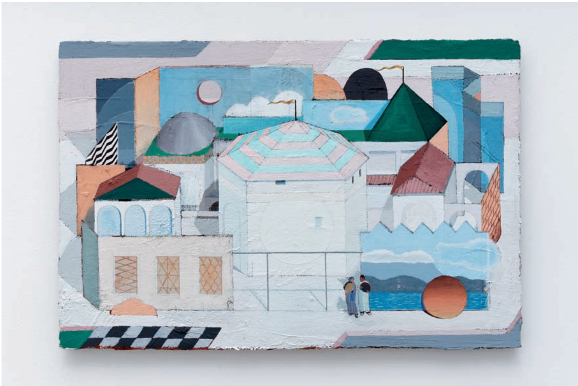
Hexagon Sun , 2011 tempera oil on linen 40 x 60 cm