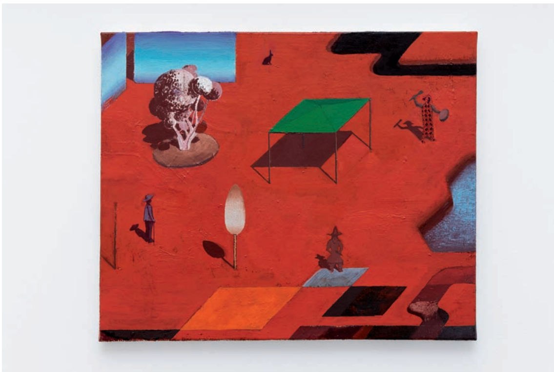
Green Canopy , 2011 tempera oil on linen 40 x 50 cm