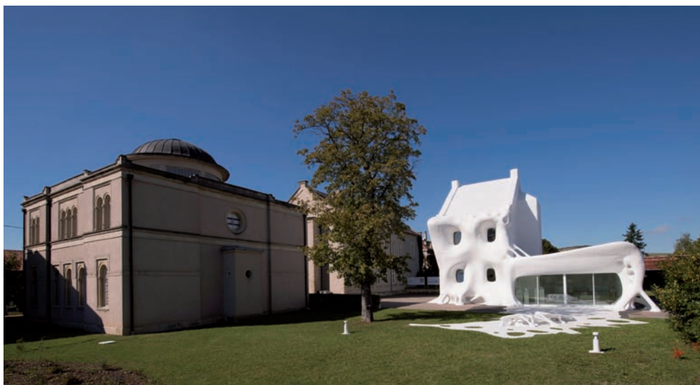
Gue(ho)st House , public commission by Berdager & Péjus, 2012 Synagogue de Delme Contemporary Art Centre © Adagp, Paris / photo OHDancy

Inaugurated on 22 September 2012, Gue(ho)st House is an architecture-sculpture made out of an existing building. It offers new visitor reception spaces dedicated to mediation and documentation, and allows everyone to prolong their visit to the exhibitions at the art centre.