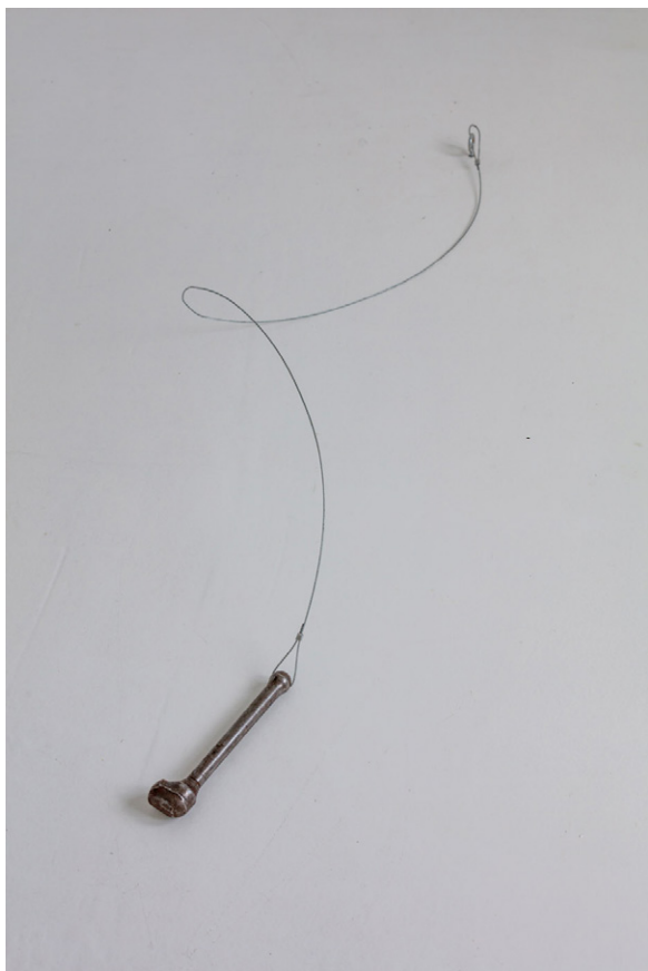
Jean-Luc Moulène, Manivelle de pédalier (asservie) , Paris, 2003 Steel. 140 cm Courtesy Galerie Chantal Crousel, Paris View of the exhibition Objets et faits , CAC - la synagogue de Delme, 2018. Photo: O.H. Dancy.