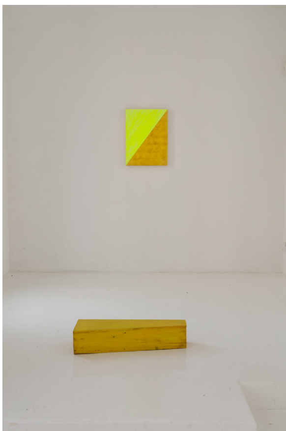
Jean-Luc Moulène, S.T. 033 , 2018. Gold leaf and stabilo on panel. 61 x 46 cm

View of the exhibition Objets et faits , CAC - la synagogue de Delme, 2018.