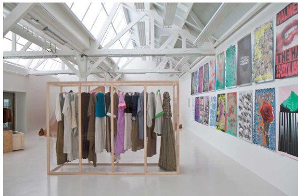
Marielle Chabal. Views of the exhibition at 40mcube. 2018