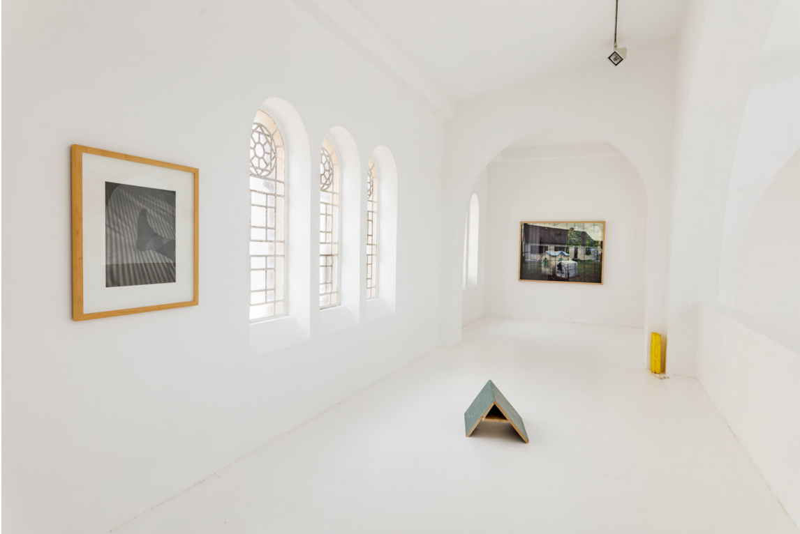
Jean-Luc Moulène View of the exhibition Objets et faits , CAC - la synagogue de Delme, 2018.