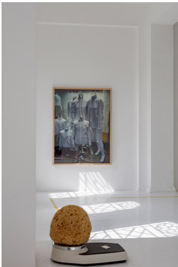
Jean-Luc Moulène, En chemise , Paris, 4 July 2007 Cibachrome on aluminium 130 x 167 x 5 cm