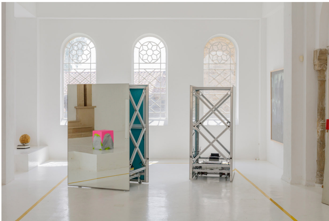
Jean-Luc Moulène View of the exhibition Objets et faits , CAC - la synagogue de Delme, 2018.