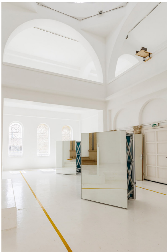
Jean-Luc Moulène View of the exhibition Objets et faits , CAC - la synagogue de Delme, 2018.