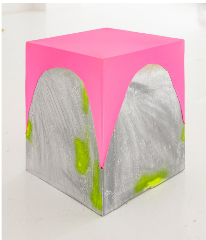
Jean-Luc Moulène, Contre-Dôme , Paris, 12 August 2012 Styrofoam, resin, paints, lycra. 34 x 34 x 42 cm Courtesy Galerie Chantal Crousel, Paris View of the exhibition Objets et faits , CAC - la synagogue de Delme, 2018. Photo: O.H. Dancy.