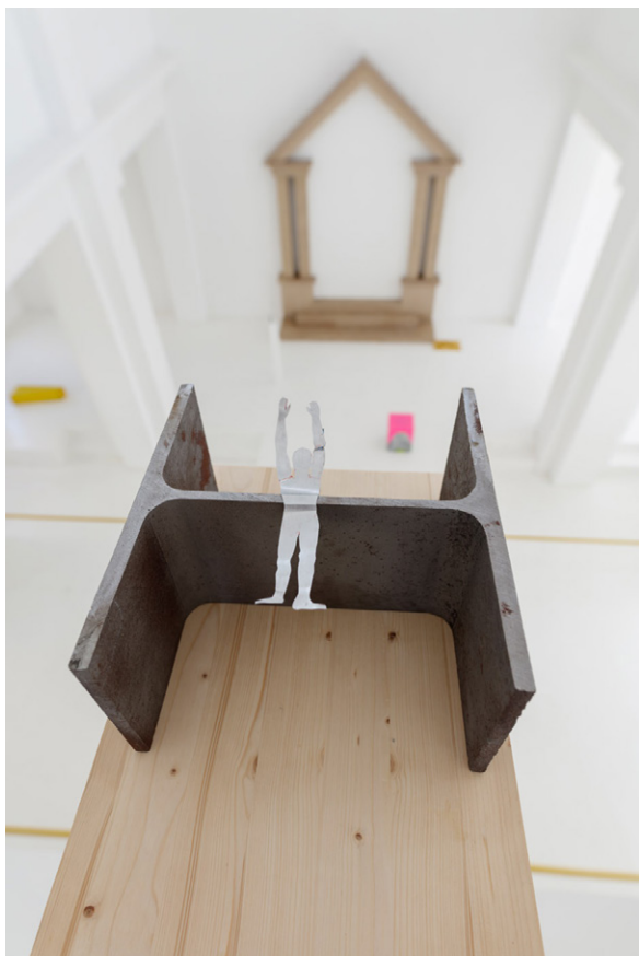
Jean-Luc Moulène, Théâtre (IPN) , Paris, June 2004 Wood, metal, aluminium, 11,7 x 5,25 x 5,25 cm Courtesy Galerie Chantal Crousel, Paris View of the exhibition Objets et faits , CAC - la synagogue de Delme, 2018. Photo: O.H. Dancy.