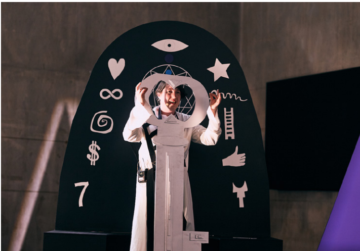
Louise Siffert This is your day ! - Vous êtes extraordinaire , 2018, Performance.