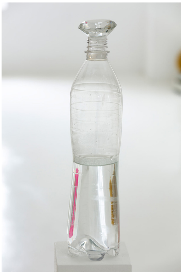
Jean-Luc Moulène, Riche , Le Havre, January 2010 1,5 L plastic bottle reduced on low heat, artificial diamond, water Ø 7 cm x 32 cm View of the exhibition Objets et faits , CAC - la synagogue de Delme, 2018.