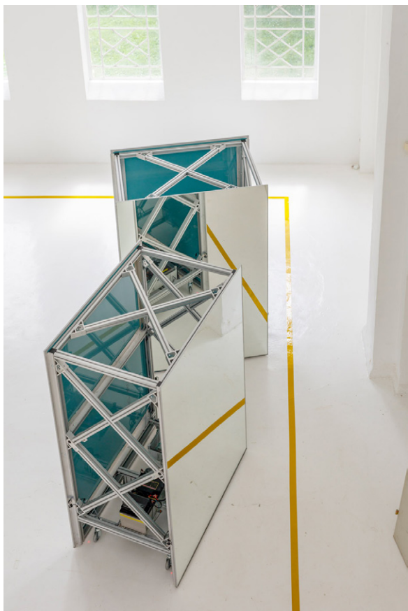
Jean-Luc Moulène, COSMO 1 & 2 , 2017 Mobile, mirrors, motors, programmable logic controllers, sensors, metal structure 180 x 120 x 80 cm Courtesy Galerie Chantal Crousel, Paris View of the exhibition Objets et faits , CAC - la synagogue de Delme, 2018. Photo: O.H. Dancy.