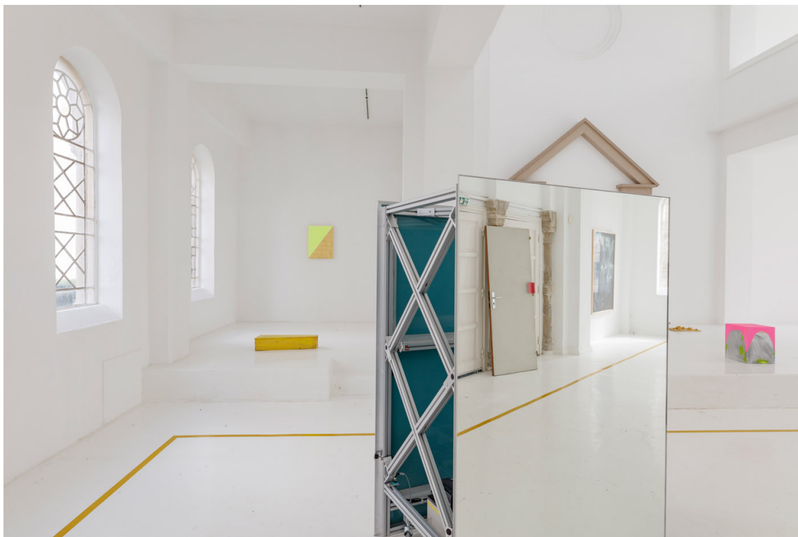
Jean-Luc Moulène View of the exhibition Objets et faits , CAC - la synagogue de Delme, 2018.