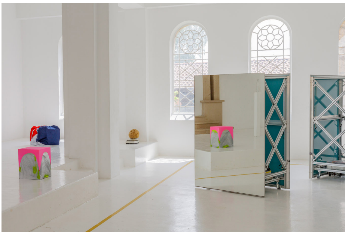
Jean-Luc Moulène View of the exhibition Objets et faits , CAC - la synagogue de Delme, 2018.