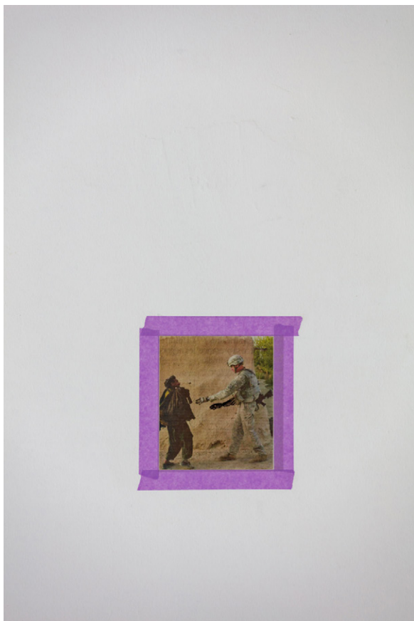
Jean-Luc Moulène, Brève 1 , Paris, 2017 Four-color process on paper, 17 x 15,5 cm View of the exhibition Objets et faits , CAC - la synagogue de Delme, 2018.