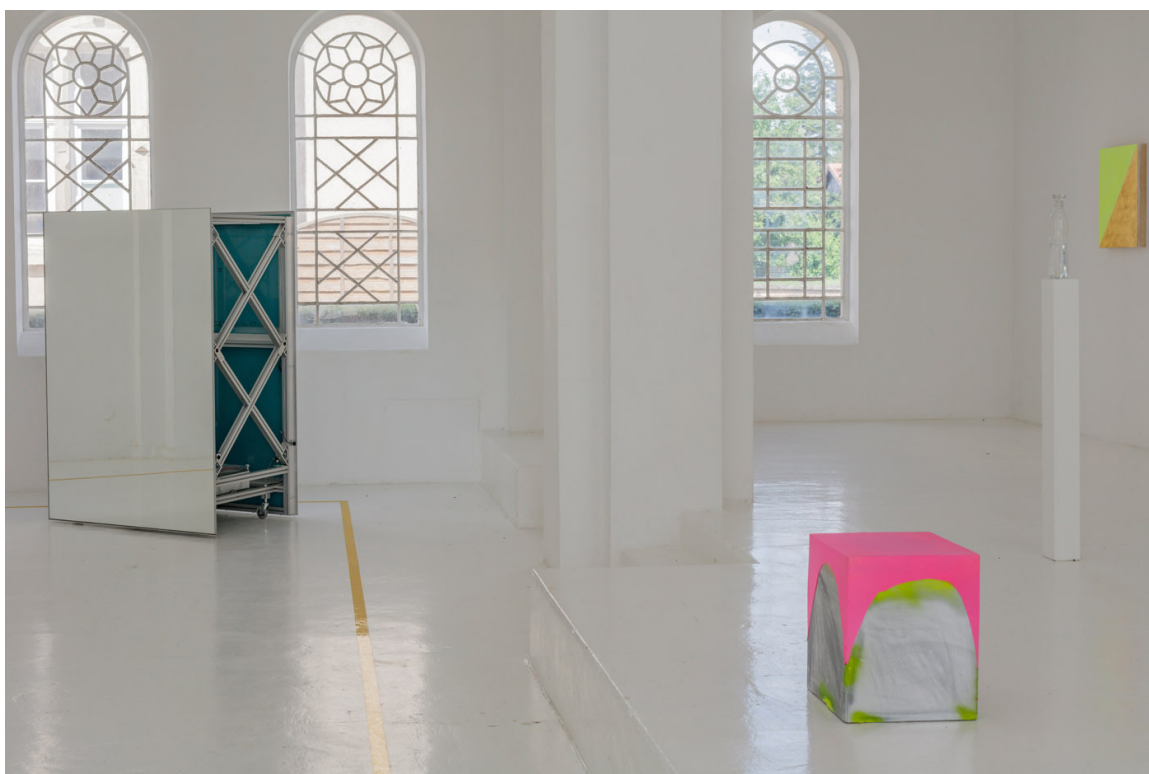
Jean-Luc Moulène View of the exhibition Objets et faits , CAC - la synagogue de Delme, 2018.