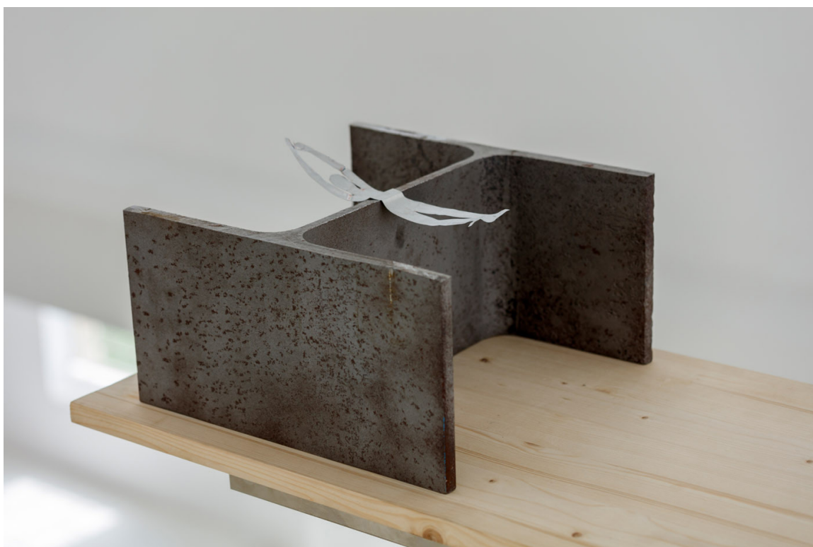
Jean-Luc Moulène, Théâtre (IPN) , Paris, June 2004 Wood, metal, aluminium, 11,7 x 5,25 x 5,25 cm. View of the exhibition Objets et faits , CAC - la synagogue de Delme, 2018.