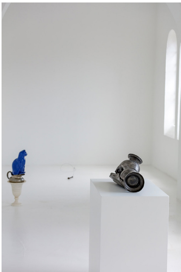
Jean-Luc Moulène View of the exhibition Objets et faits , CAC - la synagogue de Delme, 2018.