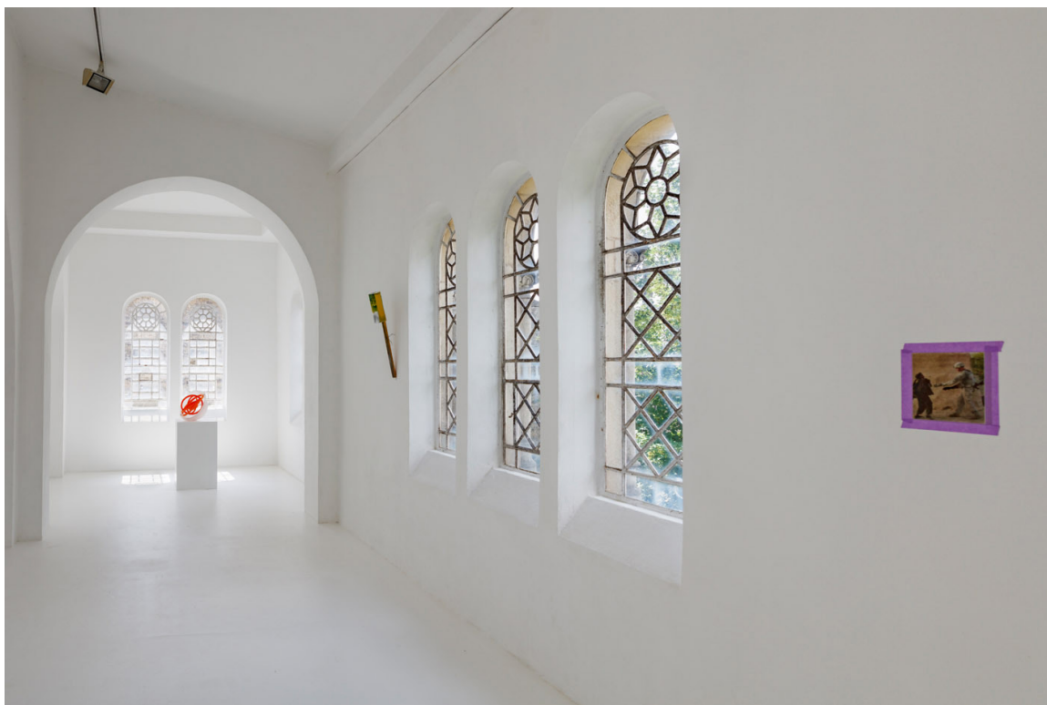
Jean-Luc Moulène View of the exhibition Objets et faits , CAC - la synagogue de Delme, 2018.