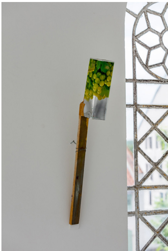
Jean-Luc Moulène, Manifeste Errata Manifeste , Paris, 1991 Wood, coated paper, 7,5 x 8,5 x 65,5 cm Courtesy Galerie Chantal Crousel, Paris View of the exhibition Objets et faits , CAC - la synagogue de Delme, 2018. Photo: O.H. Dancy.