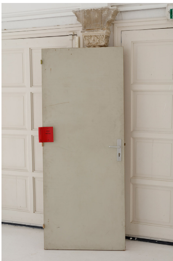
Jean-Luc Moulène, Dégondée , Ivry sur Seine, September 2010 Door, 2009 Dalloz Labor Code, nails 205 x 72 x 16 cm View of the exhibition Objets et faits , CAC - la synagogue de Delme, 2018.