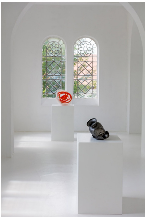
Jean-Luc Moulène, Mondex , Paris, March 2006 Plastic basins, wood. Ø 45 cm on base 60 x 60 x 100 cm