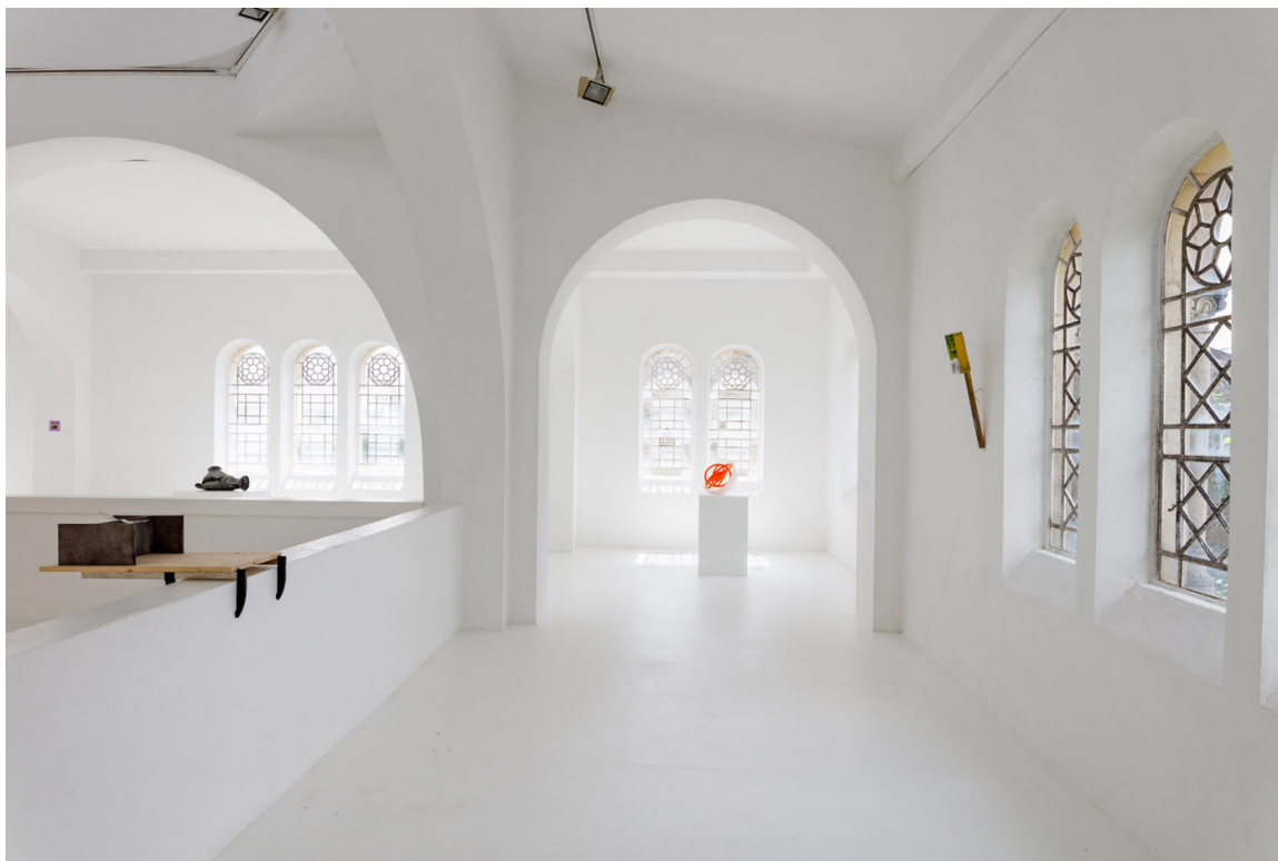
Jean-Luc Moulène View of the exhibition Objets et faits , CAC - la synagogue de Delme, 2018.