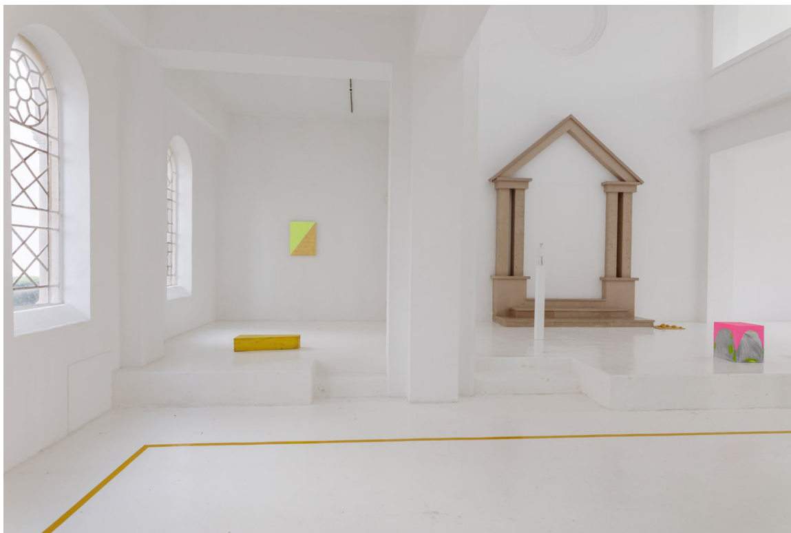
Jean-Luc Moulène View of the exhibition Objets et faits , CAC - la synagogue de Delme, 2018.