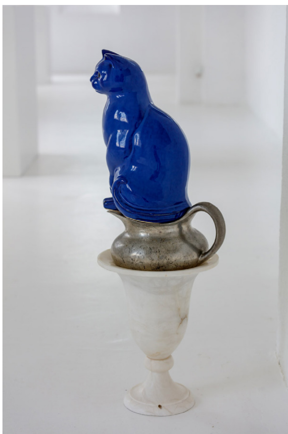
Jean-Luc Moulène, Héritage (axe) , 2018 Marble, tin, porcelain, Ø 30, 72,5 cm Courtesy of the artist View of the exhibition Objets et faits , CAC - la synagogue de Delme, 2018.