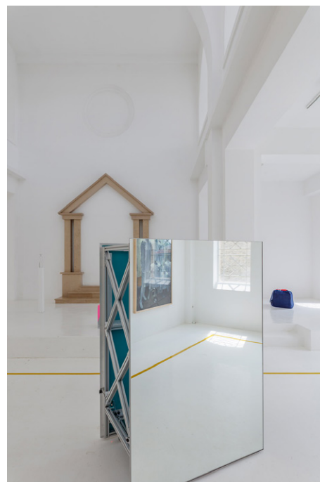
Jean-Luc Moulène View of the exhibition Objets et faits , CAC - la synagogue de Delme, 2018.