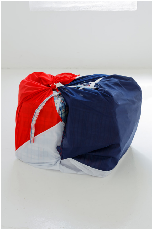
Jean-Luc Moulène, Héritage , 2018 Far-right, pétainist, revisionist and antisemitic books and periodicals, plastic bags, French flag (120 x 180 cm) 65 x 45 x 45 cm Courtesy of the artist View of the exhibition Objets et faits , CAC - la synagogue de Delme, 2018.