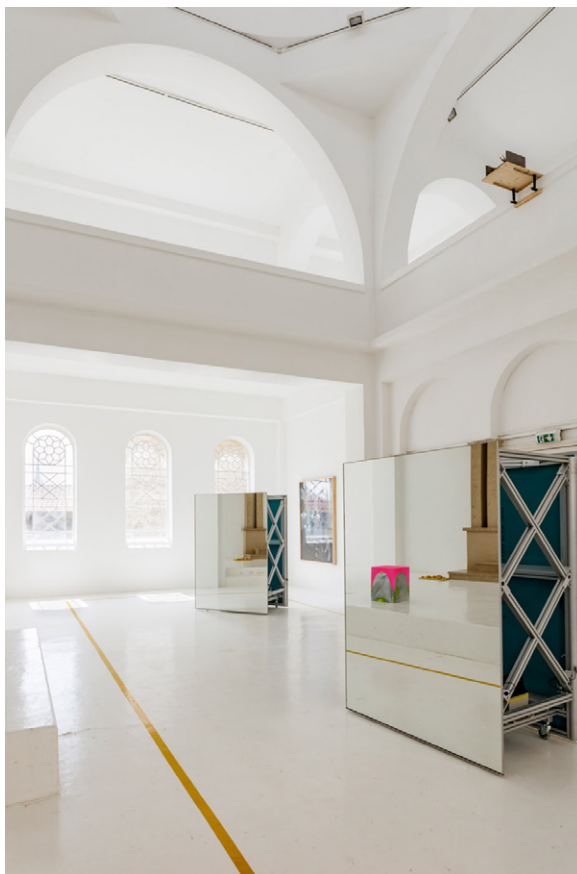
Jean-Luc Moulène View of the exhibition Objets et faits , CAC - la synagogue de Delme, 2018.