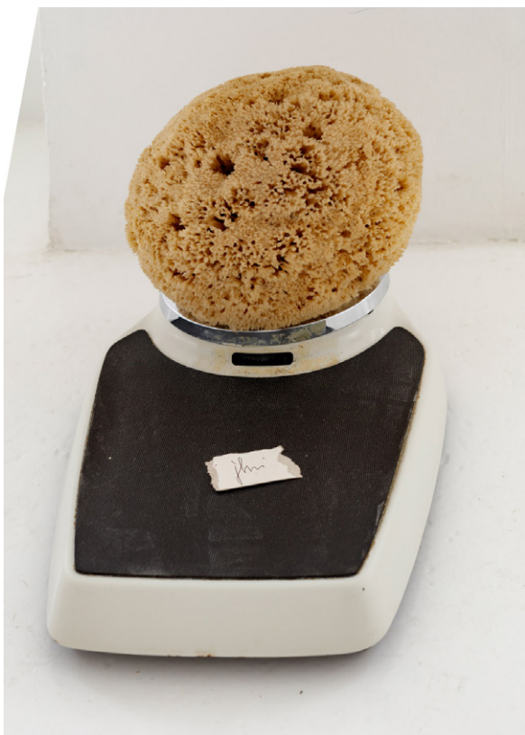
Jean-Luc Moulène, Personne , 2018 Bathroom scale, natural sponge, cardboard 32 x 30 x 45 cm Courtesy of the artist

View of the exhibition Objets et faits , CAC - la synagogue de Delme, 2018. Photo: O.H. Dancy.