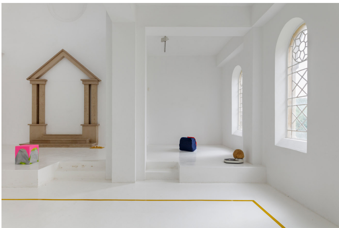
Jean-Luc Moulène View of the exhibition Objets et faits , CAC - la synagogue de Delme, 2018.