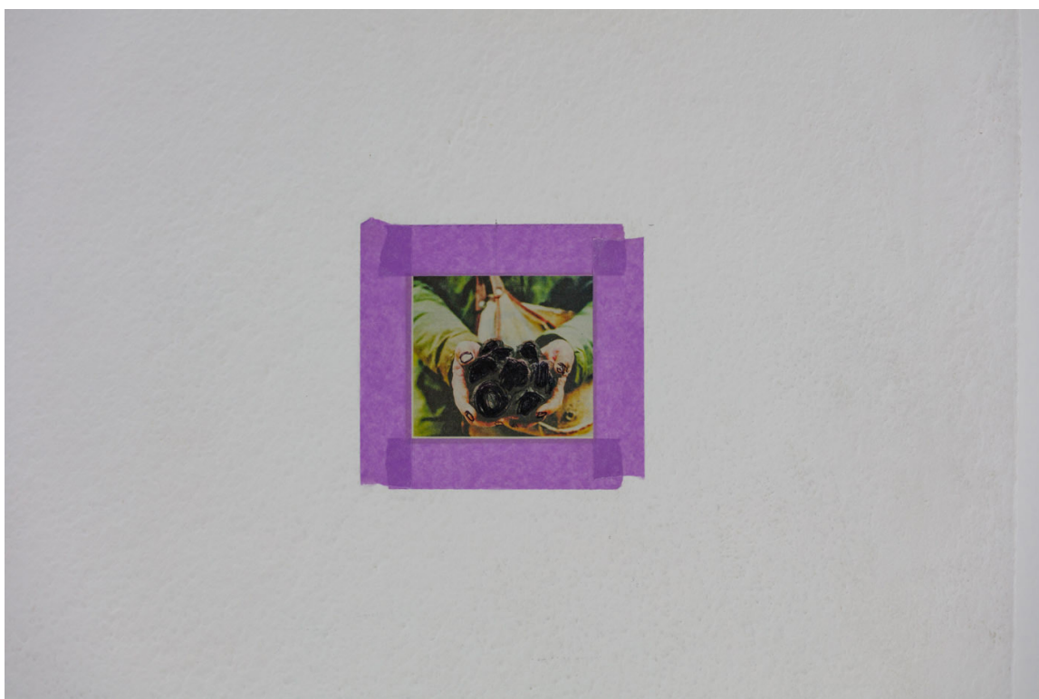
Jean-Luc Moulène, Brève 2 , Paris, 2017 Four-color process on paper, 8 x 9 cm. View of the exhibition Objets et faits , CAC - la synagogue de Delme, 2018.