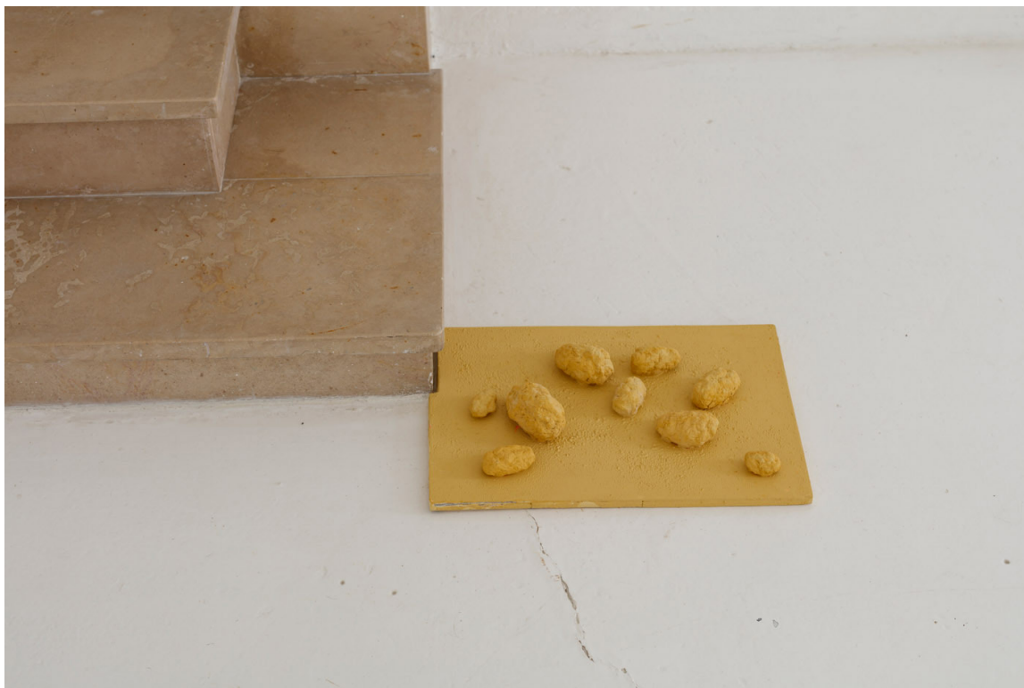
Jean-Luc Moulène, Patates , Paris, 2018. Painted wood and paper mache. 45 x 30 x 6 cm