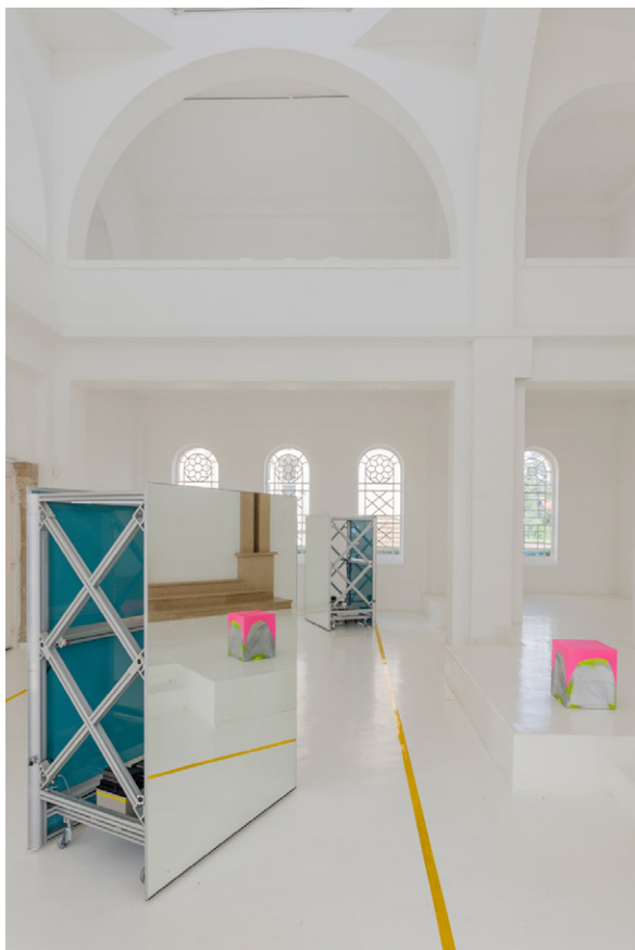
Jean-Luc Moulène View of the exhibition Objets et faits , CAC - la synagogue de Delme, 2018.