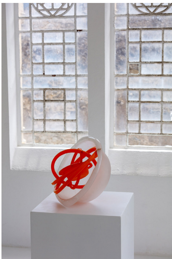
Jean-Luc Moulène, Mondex , Paris, March 2006 Plastic basins, wood. Ø 45 cm on base, 60 x 60 x 100 cm View of the exhibition Objets et faits , CAC - la synagogue de Delme, 2018.