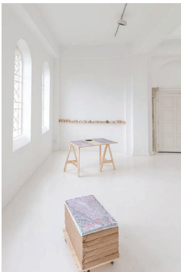
Marta Caradec, Metz en Algérie, Akbou 0 , 2018. Coproduction between centre d'art contemporain - la synagogue de Delme and 49 Nord 6 Est - FRAC Lorraine. View of the exhibition Inversion / Aversion , centre d'art contemporain - la synagogue de Delme, 2018.