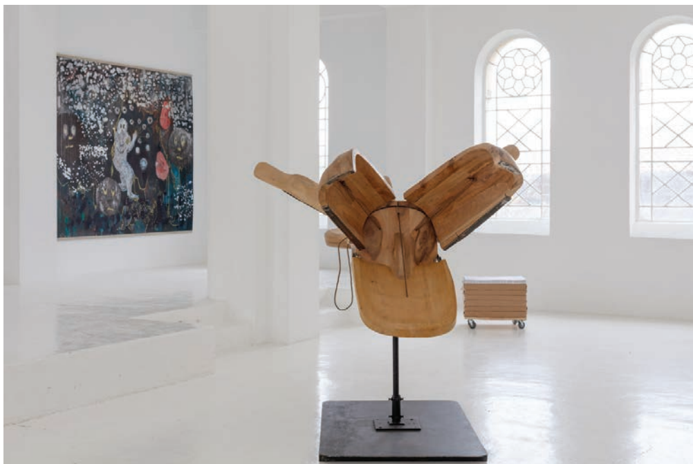
At the forefront: Denis Savary, Boréale , 2014. Collection FRAC Alsace. At the background: Hélène Delprat, L'Homme-Singe en fausse fourrure a disparu , 2014. Collection FRAC Alsace. View of the exhibition Inversion / Aversion , centre d'art contemporain - la synagogue de Delme, 2018.

HD visuals can be downloaded from the press page at www.cac-synagoguedelme.org (username and password provided upon request).