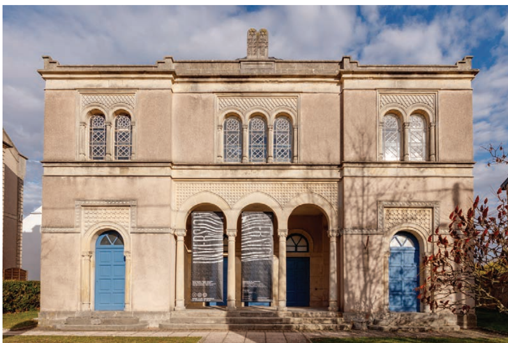
View of the exhibition Inversion / Aversion , centre d'art contemporain - la synagogue de Delme, 2018. Graphism : studio deValence