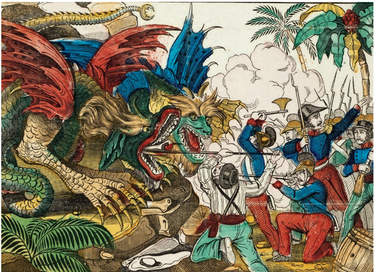
Image : Relation de l'attaque et de la prise de deux monstres marins, Dembour, 2ème quart 19ème siècle.

The CAC will be closed from 22 December 2018 to 1 January 2019 included.