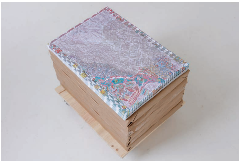
Marta Caradec, Metz en Algérie, Akbou 0 , 2018. Coproduction between centre d'art contemporain - la synagogue de Delme and 49 Nord 6 Est - FRAC Lorraine. View of the exhibition Inversion / Aversion , centre d'art contemporain - la synagogue de Delme, 2018.