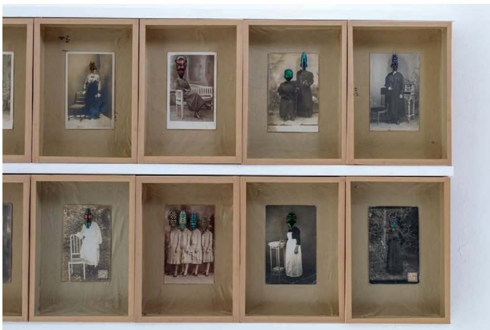
Vincent Chevillon, Les Bacchantes , 2016. Courtesy of the artist. View of the exhibition Inversion / Aversion , centre d'art contemporain - la synagogue de Delme, 2018.