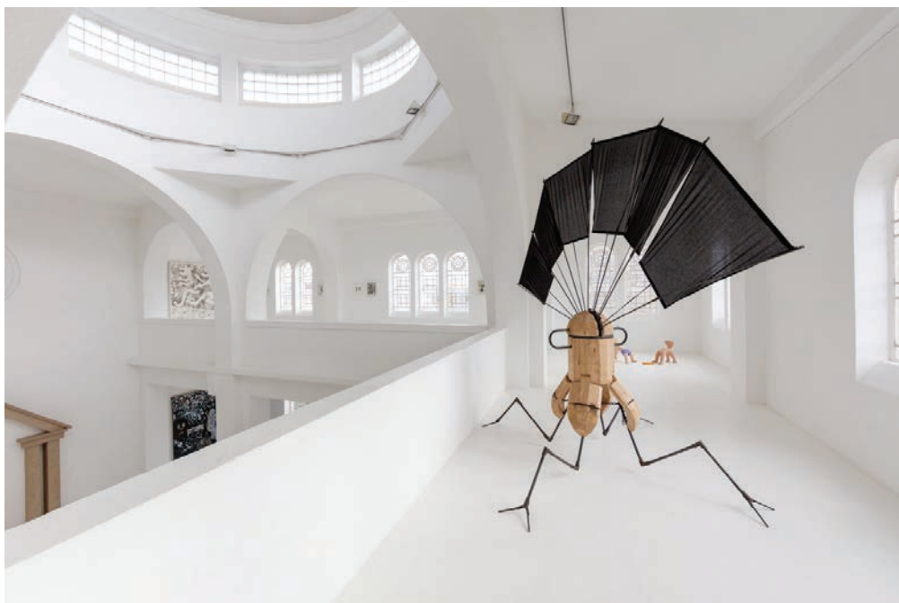
Vincent Chevillon, S10 , 2013-. View of the exhibition Inversion / Aversion , centre d'art contemporain - la synagogue de Delme, 2018.