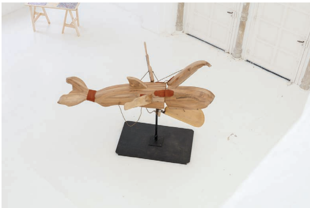
Denis Savary, Boréale , 2014. Collection FRAC Alsace. View of the exhibition Inversion / Aversion , centre d'art contemporain - la synagogue de Delme, 2018.