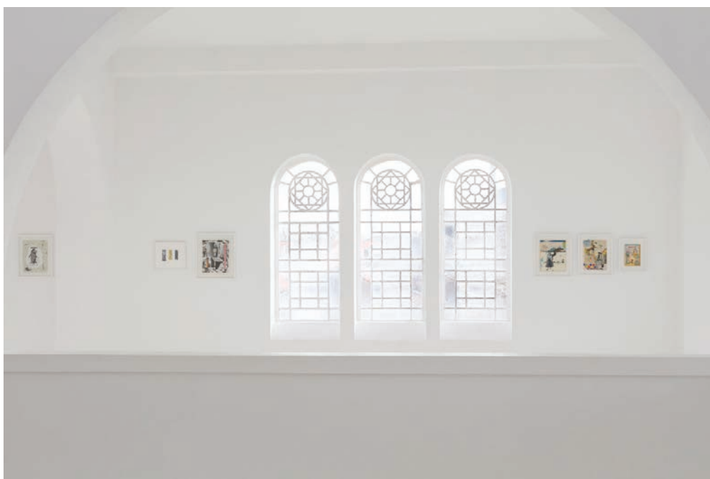
First artwork on the left and the last three ones on the right: Hippolyte Hentgen, série Sunday in Kyoto , 2018. Courtesy Galerie Semiose. Second artwork on the left: Hippolyte Hentgen, Pagu , 2014. Courtesy Galerie Semiose. Third artwork on the left: Hippolyte Hentgen, série 1,2,3 , 2017. Courtesy Galerie Semiose. View of the exhibition Inversion / Aversion , centre d'art contemporain - la synagogue de Delme, 2018. Photo: OH Dancy.