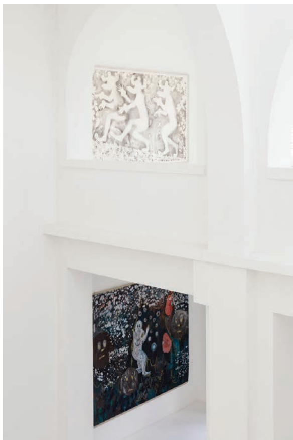
Downstairs: Hélène Delprat, L'Homme-Singe en fausse fourrure a disparu , 2014. Collection FRAC Alsace. Upstairs: Hippolyte Hentgen, série Poodle , 2017. Courtesy Galerie Semiose. View of the exhibition Inversion / Aversion , centre d'art contemporain - la synagogue de Delme, 2018.