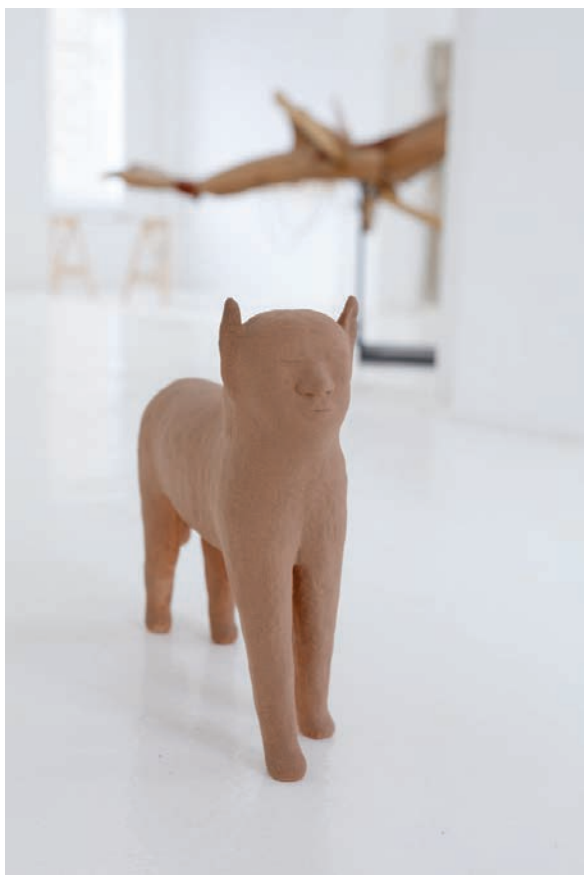
Corentin Grossmann, Miaou , 2018. Courtesy galerie Art: Concept, Paris. View of the exhibition Inversion / Aversion , centre d'art contemporain - la synagogue de Delme, 2018. Photo: OH Dancy.