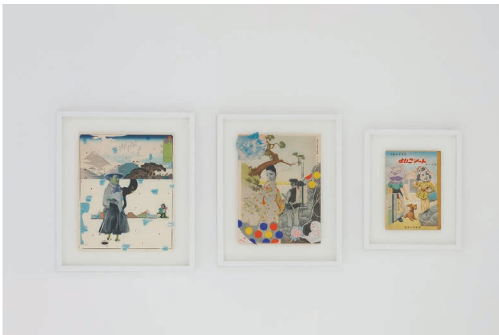
Hippolyte Hentgen, série Sunday in Kyoto , 2018. View of the exhibition Inversion / Aversion , centre d'art contemporain - la synagogue de Delme, 2018.