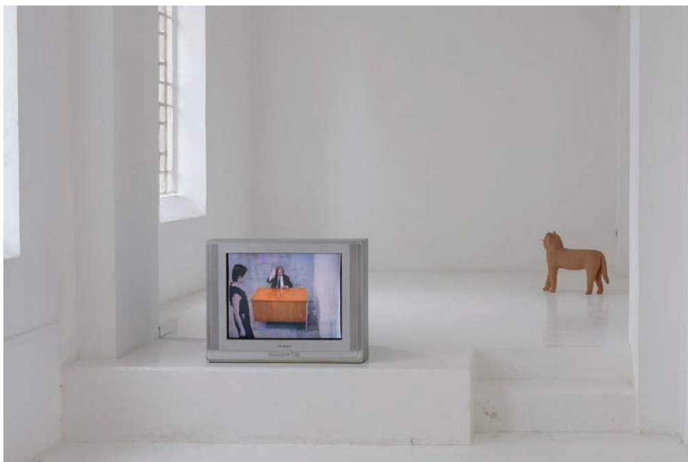
At the forefront: Jimmie Durham, Smashing , 2005. Collection FRAC Champagne-Ardenne. At the background: Corentin Grossmann, Miaou , 2018. Courtesy galerie Art: Concept, Paris. View of the exhibition Inversion / Aversion , centre d'art contemporain - la synagogue de Delme, 2018. Photo: OH Dancy.