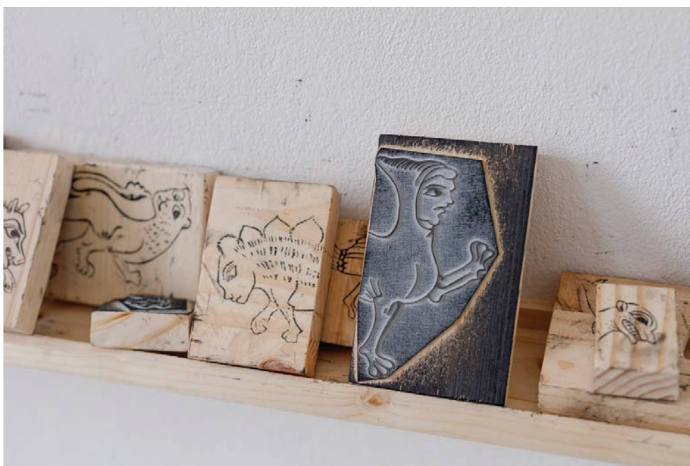
Marta Caradec, Metz en Algérie, Akbou 0 , 2018. Coproduction between centre d'art contemporain - la synagogue de Delme and 49 Nord 6 Est - FRAC Lorraine. View of the exhibition Inversion / Aversion , centre d'art contemporain - la synagogue de Delme, 2018.