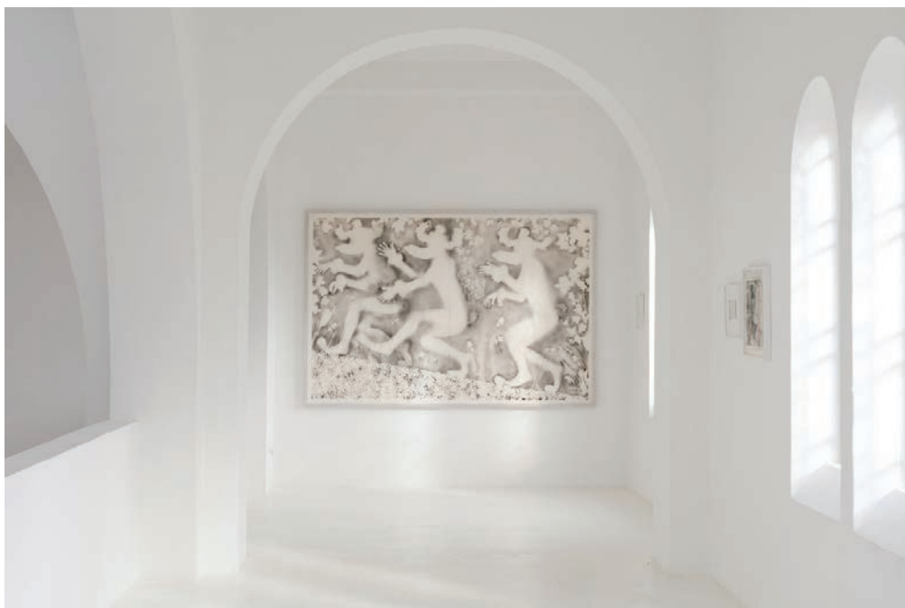
Hippolyte Hentgen, série Poodle , 2017. Courtesy Galerie Semiose. View of the exhibition Inversion / Aversion , centre d'art contemporain - la synagogue de Delme, 2018. Photo: OH Dancy.