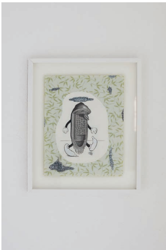
Hippolyte Hentgen, série Sunday in Kyoto , 2018. View of the exhibition Inversion / Aversion , centre d'art contemporain - la synagogue de Delme, 2018.