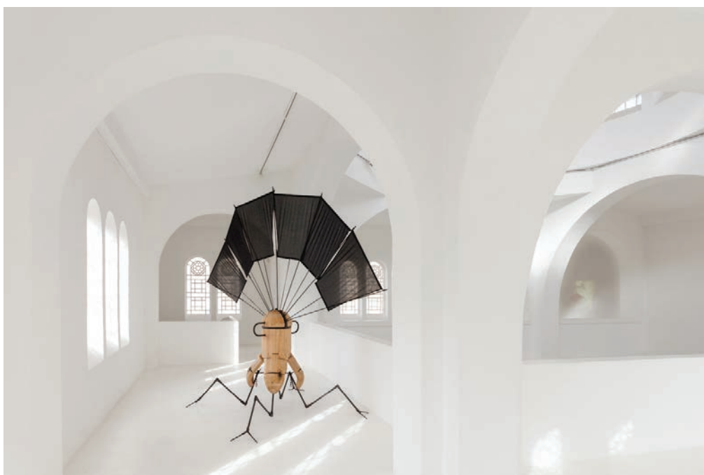
Vincent Chevillon, S10 , 2013-. Courtesy of the artist. View of the exhibition Inversion / Aversion , centre d'art contemporain - la synagogue de Delme, 2018. Photo: OH Dancy.