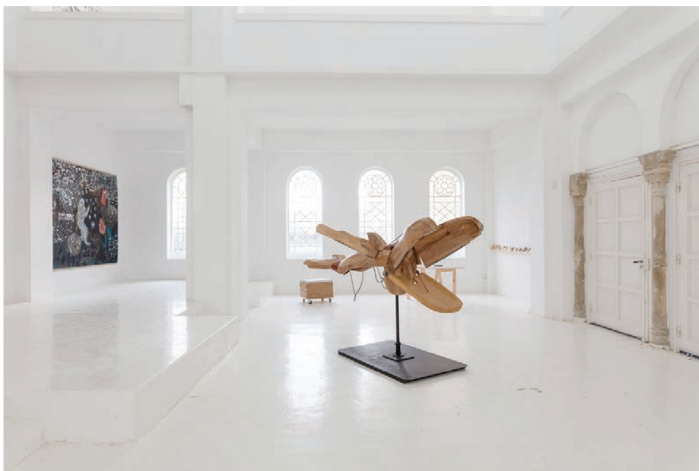
At the forefront: Denis Savary, Boréale , 2014. Collection FRAC Alsace. On the left: Hélène Delprat, L'Homme-Singe en fausse fourrure a disparu , 2014. Collection FRAC Alsace. At the background: Marta Caradec, Metz en Algérie, Akbou 0 , 2018. Coproduction between the centre d'art contemporain - la synagogue de Delme and 49 Nord 6 Est - FRAC Lorraine. View of the exhibition Inversion / Aversion , centre d'art contemporain - la synagogue de Delme, 2018.