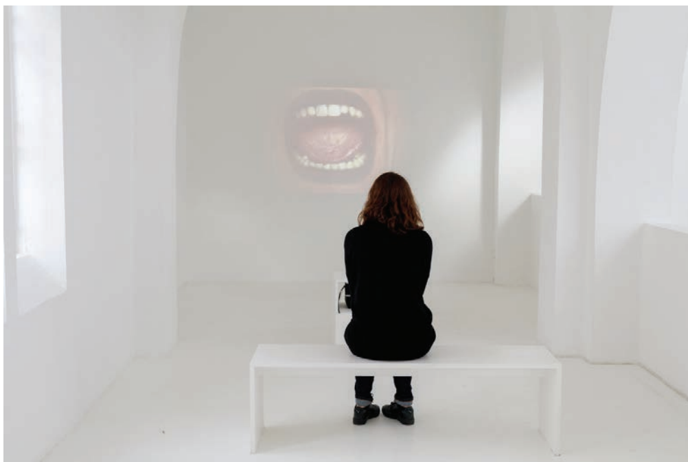
Anna Maria Maiolino, In-Out (Antropofagia) , 1973. Collection 49 Nord 6 Est - FRAC Lorraine. View of the exhibition Inversion / Aversion , centre d'art contemporain - la synagogue de Delme, 2018.