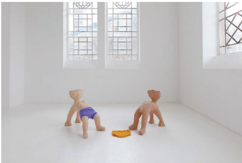
Corentin Grossmann, Yoga 1 et Yoga 2 , 2016. Courtesy galerie Art: Concept, Paris. View of the exhibition Inversion / Aversion , centre d'art contemporain - la synagogue de Delme, 2018. Photo: OH Dancy.