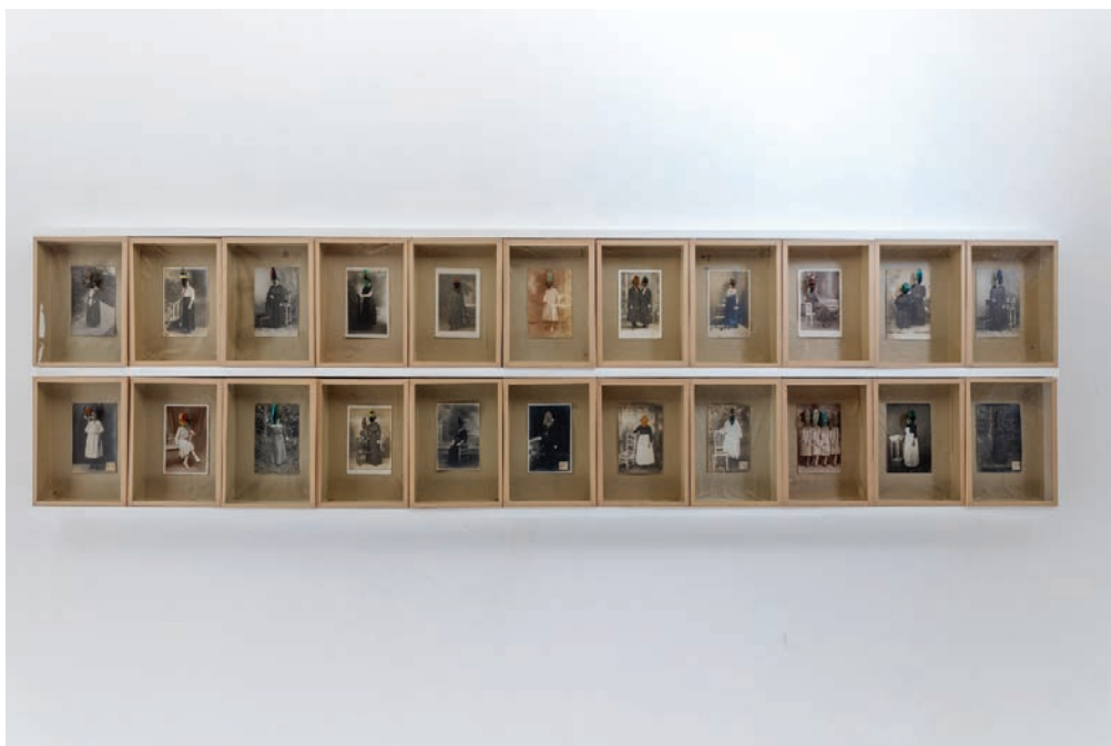
Vincent Chevillon, Les Bacchantes , 2016. View of the exhibition Inversion / Aversion , centre d'art contemporain - la synagogue de Delme, 2018.