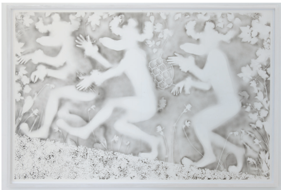
Hippolyte Hentgen, Série "Poodles" , 2017 Ink on paper, 120x160 cm