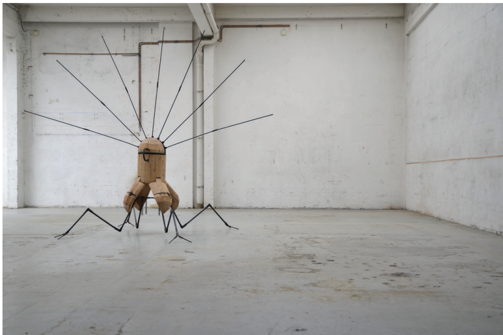
Vincent Chevillon, Sonde S10 Work in progress Courtesy of the artist.

HD visuals can be downloaded from the press page at www.cac-synagoguedelme.org (username and password provided upon request). Exhibition views will be available after the opening.