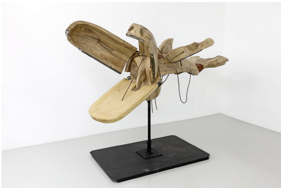
Denis SAVARY, Boréale , 2014 Walnut wood, okoumé wood, leather, metal, rope, 150 x 250 x 100 cm Frac Alsace Photo : Denis Savary