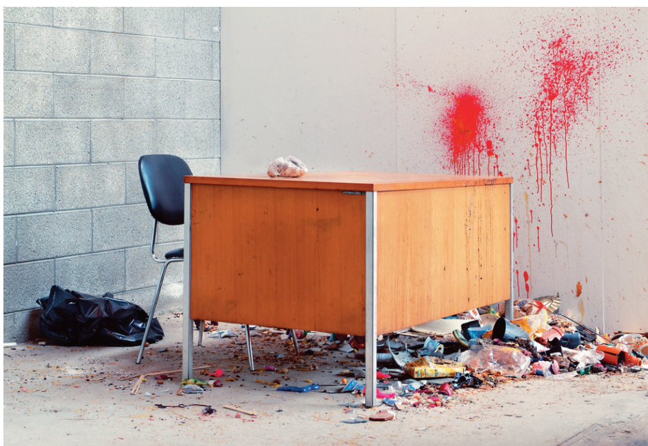
Jimmie DURHAM, Smashing , 2005 Video, duration : 92'00'' Frac Champagne-Ardenne