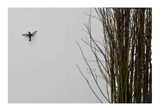
Dominique Ghesquière, Forêt ("Forest"), 2018, hazel branches; and Oiseau ("Bird"), 2014, stuffed starling. From the exhibition "Pierres des fées" ("Fairy stones"), Le Point Commun, Cran-Gevrier, 2018.