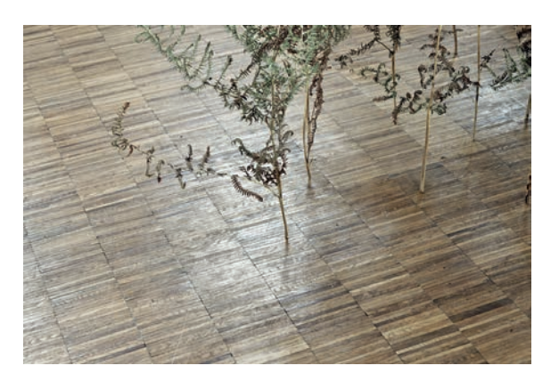
Dominique Ghesquière, Passage , 2013, ferns. From the exhibition "Terre de profondeur" ("Deep earth"), CIAP Île de Vassivière, 2013. Courtesy of the artist. Photo: Aurélien Mole