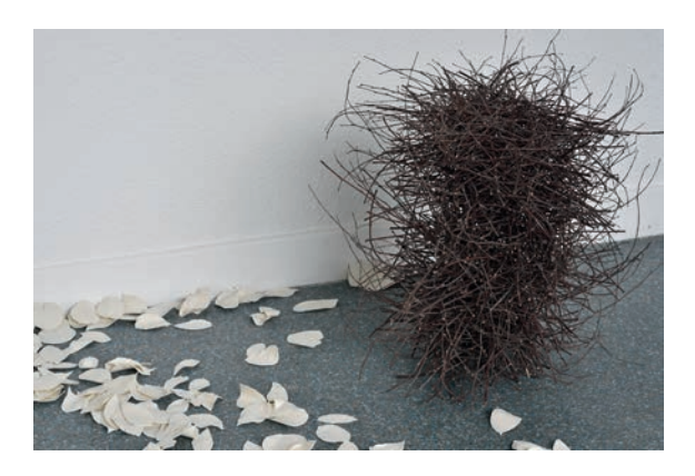
Dominique Ghesquière, Conférence des oiseaux ("Conference of birds"), 2018, birch twigs; and Feuilles ("Leaves"), 2018, porcelain. From the exhibition "Pierres des fées" ("Fairy stones"), Le Point Commun, Cran-Gevrier, 2018.