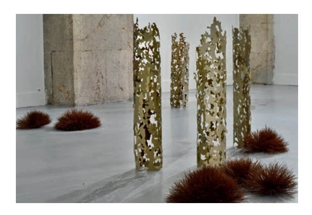
Dominique Ghesquière, Rideau d'arbres ("Tree curtain"), 2016, sycamore wood, paint; and Herbes rares ("Rare grasses"), 2017, pine needles. From an exhibition at Galerie des Ponchettes/MAMAC, Nice, 2017.