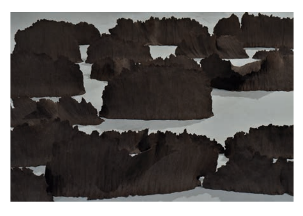
Dominique Ghesquière, Vagues ("Waves"), 2017, terracotta. Co-production and exhibition at Galerie des Ponchettes/ MAMAC, Nice, 2017. Acquired by the CNAP 2018. Courtesy of the artist. Photo: Dominique Ghesquière