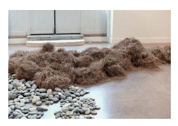
Dominique Ghesquière, Mémoire d'eau ("Water memory"), 2016, pine needles; and Pierres roulées ("Rolled stones"), 2014, pebbles, Collection Frac Aquitaine. From the exhibition "Les trois lointains" ("Three distant things"), Parc Culturel de Rentilly, 2016.