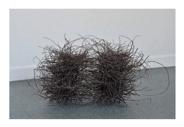
Dominique Ghesquière, Conférence des oiseaux ("Conference of birds"), 2018, birch twigs. From the exhibition "Pierres des fées" ("Fairy stones"), Le Point Commun, Cran-Gevrier, 2018. Courtesy of the artist. Photo: Dominique Ghesquière