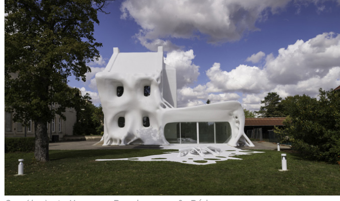
Gue(ho)st House, Berdaguer & Péjus. © Adagp Paris 2012 / Berdaguer & Péjus. Photo: OH Dancy.