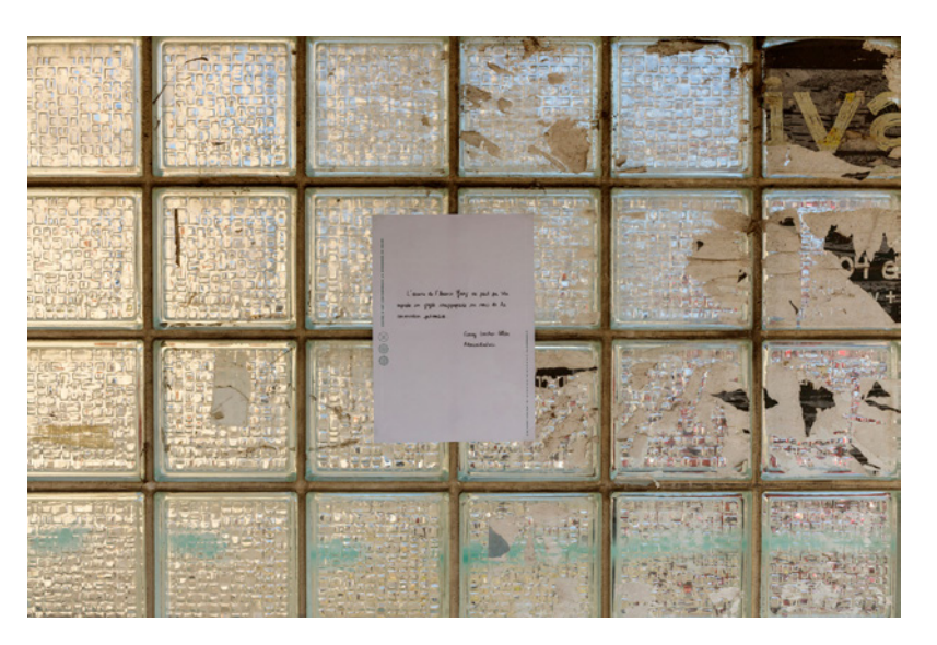
Florence Jung, Jung55 , 2017, protocol-scenario to be reactivated. Collection FRAC Champagne-Ardenne, Reims.