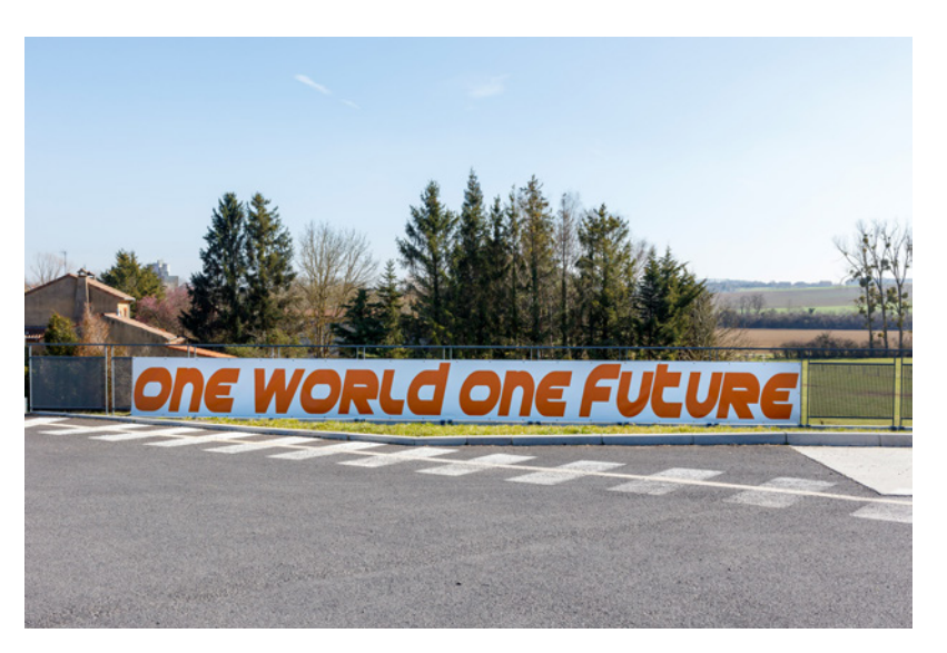
Zuzanna Czebatul, One World One Future, 2021, print on PVC tarp, 90 \times 1000 cm.