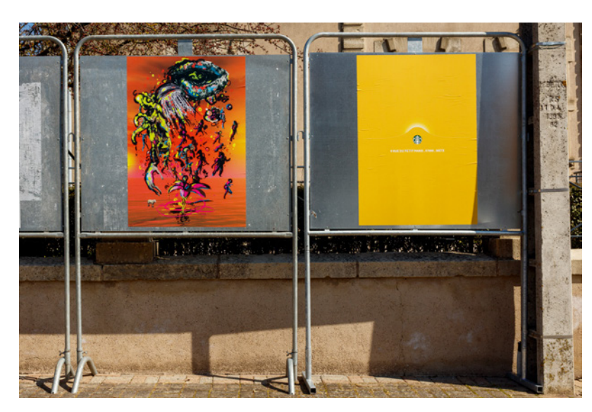
John Russell, Covid Ascension , 2021, poster, 84 x 119 cm / Camille Blatrix, 9 RUE DU PETIT PARS.57000.METZ , 2021, poster, 84 x 119 cm.