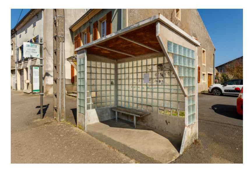
Florence Jung, Jung55 , 2017, protocol-scenario to be reactivated. Collection FRAC Champagne-Ardenne, Reims.