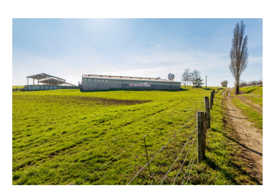
Exhibition view PARTY DE CAMPAGNE, CAC - la synagogue de Delme, 2021.