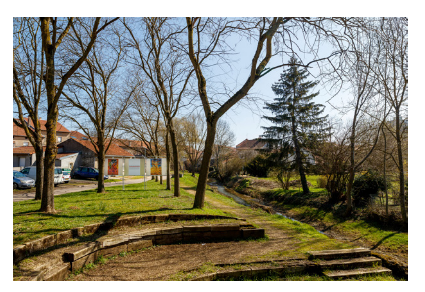
Exhibition view PARTY DE CAMPAGNE, CAC - la synagogue de Delme, 2021.