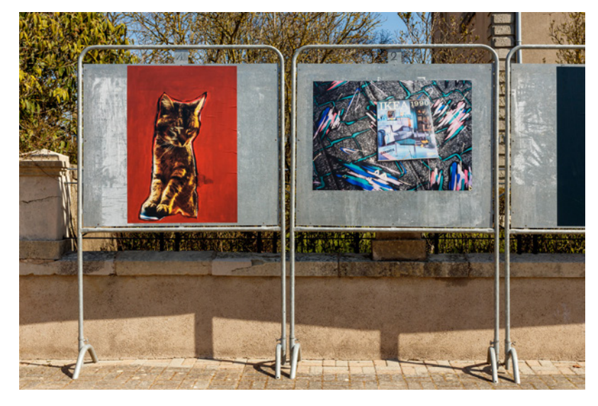
Tobias Spichtig, Love and Die , 2021, poster, 84 x 119 cm / Henrike Naumann, IKEA 1990 , 2016, poster, 84 x 119 cm