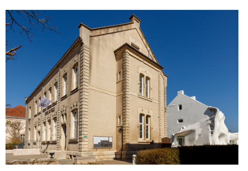
Exhibition view PARTY DE CAMPAGNE, CAC - la synagogue de Delme, 2021.