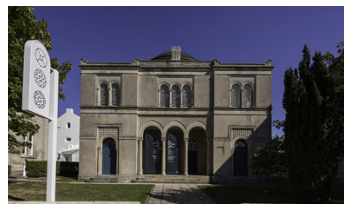
CAC - la synagogue de Delme.