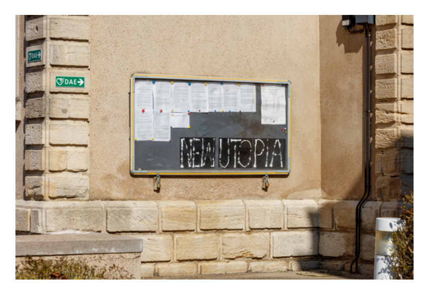
Gina Folly, NEW\ UTOPIA , 2021, photogram of animal bones, Aluminium Notice Display locked.