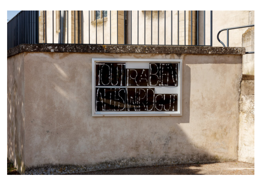
Gina Folly, TOUT ALLES IRA WIRD BIEN GUT, 2021, photogram of animal bones, Aluminium Notice Display locked.