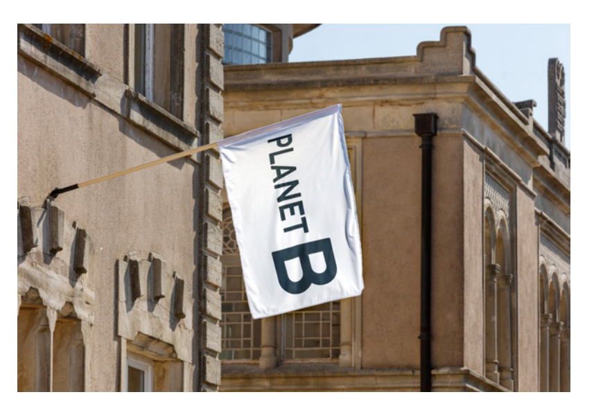
Marianne Villière, Planète B, 2020, printed fabric, 190 x 140 cm.