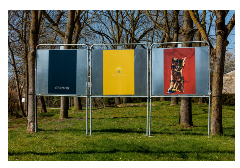
Exhibition view PARTY DE CAMPAGNE, CAC - la synagogue de Delme, 2021.