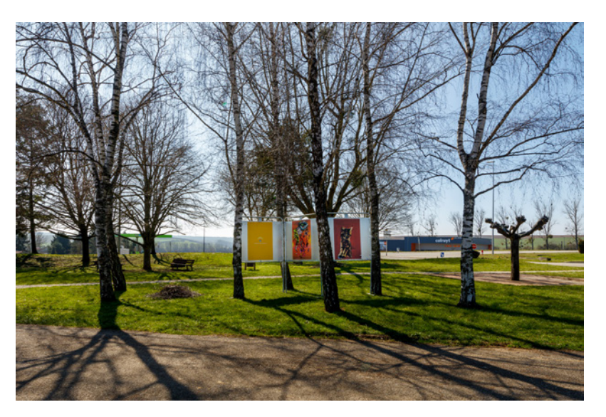
Exhibition view PARTY DE CAMPAGNE, CAC - la synagogue de Delme, 2021.