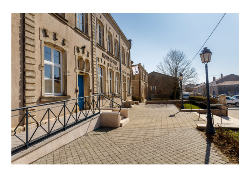
Exhibition view PARTY DE CAMPAGNE, CAC - la synagogue de Delme, 2021.