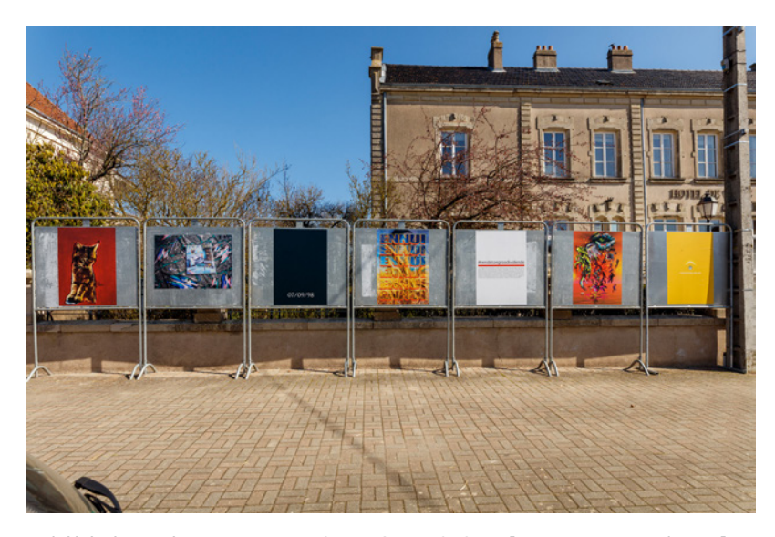
Exhibition view PARTY DE CAMPAGNE, CAC - la synagogue de Delme, 2021.