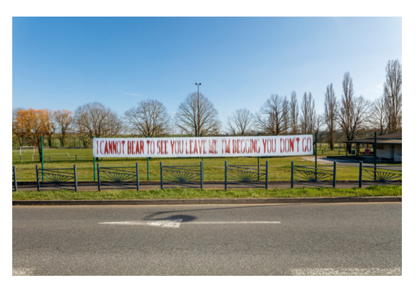
Zuzanna Czebatul, I Can Not Bear to See You Leave Me, 2021, print on PVC tarp, 90 \times 1000 cm.