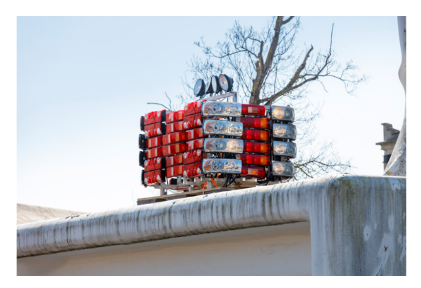
Xavier Mary, Too Many Parties , 2017, aluminium, front and rear truck headlights, neoprene cables, 146 \times 127 \times 202 \text{ cm} . Collection Uhoda.