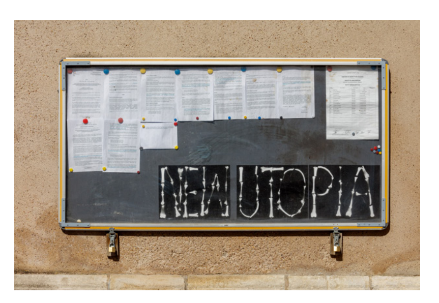
Gina Folly, NEW UTOPIA, 2021, photogram of animal bones, Aluminium Notice Display locked.