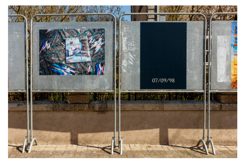
Henrike Naumann, IKEA 1990 , 2016, poster, 84 x 119 cm, photo: Inga Selch / Merlin Carpenter, 07/09/98, 2021, poster, 84 x 119 cm. Photo: OH Dancy.