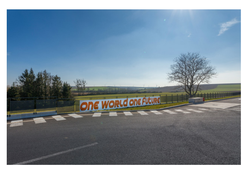
Zuzanna Czebatul, One World One Future, 2021, print on PVC tarp, 90 x 1000 cm.