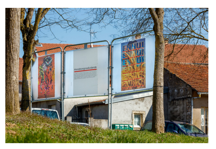
Exhibition view PARTY DE CAMPAGNE, CAC - la synagogue de Delme, 2021.