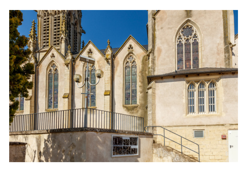
Exhibition view PARTY DE CAMPAGNE, CAC - la synagogue de Delme, 2021.