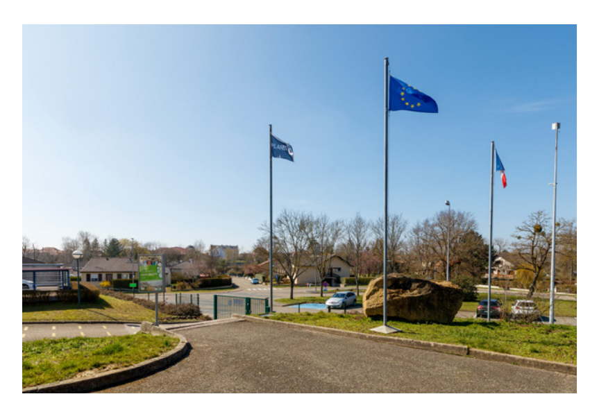
Exhibition view PARTY DE CAMPAGNE, CAC - la synagogue de Delme, 2021.