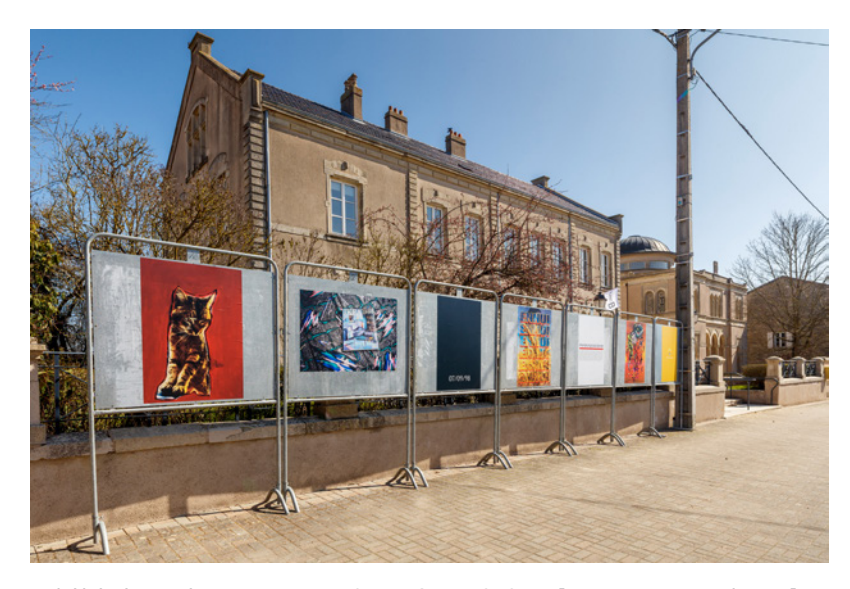
Exhibition view PARTY DE CAMPAGNE, CAC - la synagogue de Delme, 2021.

Visuels en haute-définition téléchargeables dans l'espace presse sur www.cac-synagoguedelme.org (identifiant et mot de passe sur demande).