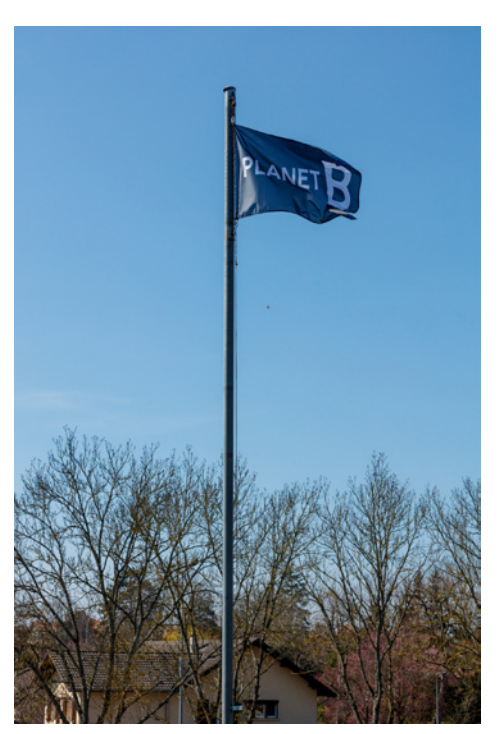
Marianne Villière, Planète B , 2020, printed fabric, 190 x 140 cm.