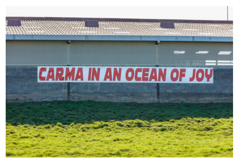
Zuzanna Czebatul, \it Carma~in~an~Ocean~of~Joy , 2021, print on PVC tarp, 90 x 1000 cm.