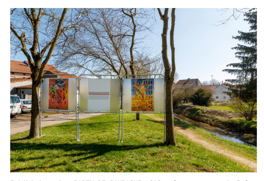
Exhibition view PARTY DE CAMPAGNE, CAC - la synagogue de Delme, 2021.