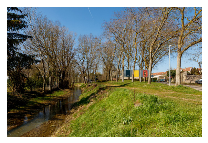
Exhibition view PARTY DE CAMPAGNE, CAC - la synagogue de Delme, 2021.