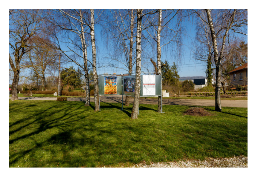
Exhibition view PARTY DE CAMPAGNE, CAC - la synagogue de Delme, 2021.