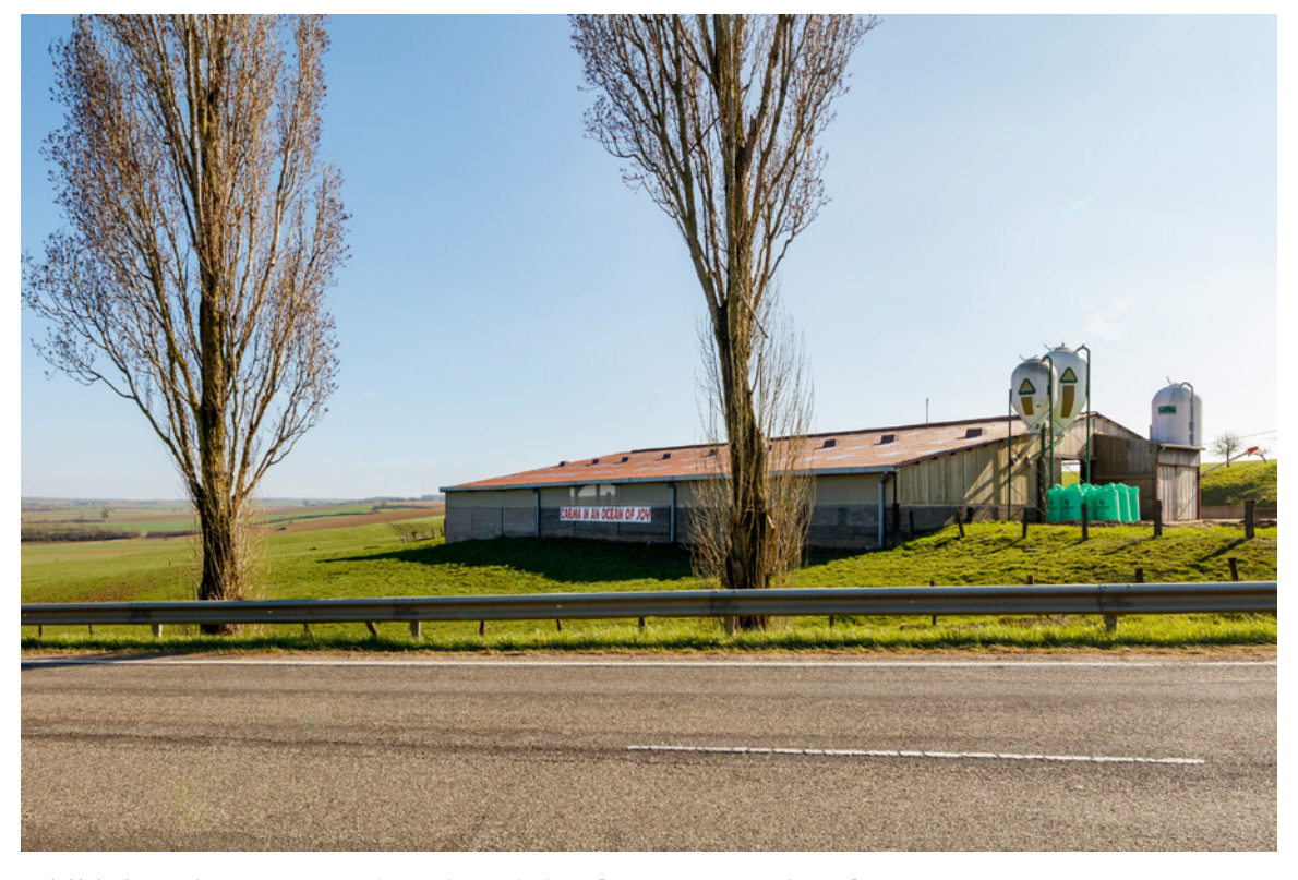
Exhibition view PARTY DE CAMPAGNE, CAC - la synagogue de Delme, 2021.