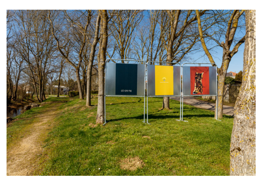
Exhibition view PARTY DE CAMPAGNE, CAC - la synagogue de Delme, 2021.