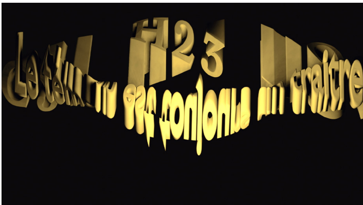
Patrik Pion, « Le témoin est toujours un traître », 2022, full HD video, 16/9, duration 00:08, loop projection.