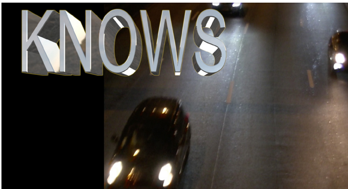
Patrik Pion, « Modernity knows... », 2022, HD video, 16/9, duration 00:43, loop projection.