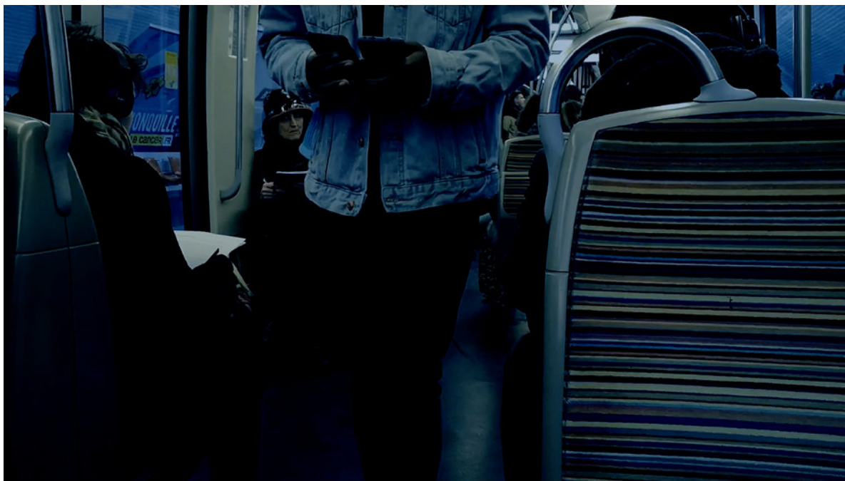
Patrik Pion, « Et moi-même... », 2020, full HD video, 16/9, duration 00:36, loop projection.