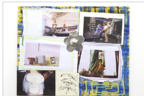
Image: Aurilian, Loose Compass , Performance at CAPC museum of contemporary art, Bordeaux, 2022.