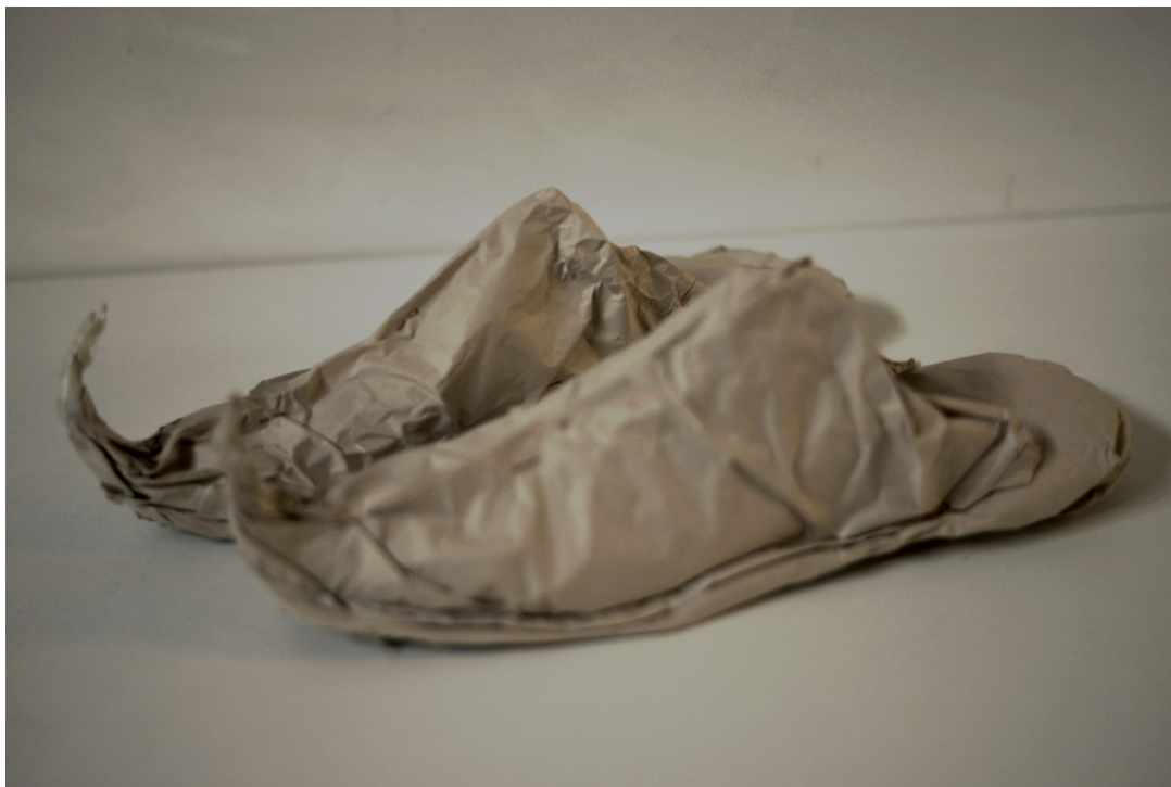
Patrik Pion, babouches , 2017, blank newsprint, staples, 40x23x23 cm.

Exhibition views will be available after the opening. HD visuals can be downloaded from the press page at www.cac-synagoguedelme.org (username and password provided upon request).