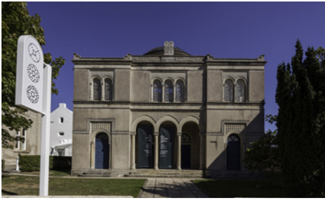
CAC - la synagogue de Delme.