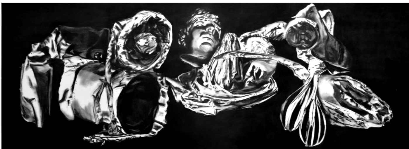
Patrik Pion, 07-19 / 22:35'' , 2019, black chalk, gray ink, white highlights on grained paper, 3200x1250 mm.