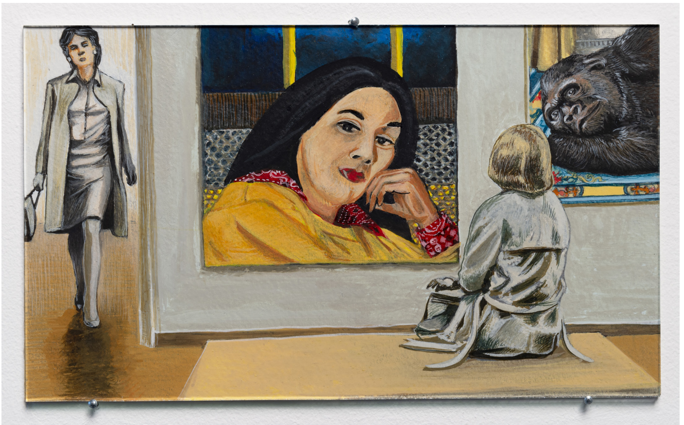
Brice Dellsperger, Angie said : «Meet me at the Met» featuring Alex Katz and Tom Palmore , 2019, gouache on paper, 13,5 x 23 cm. Courtesy of galerie Air de Paris and the artist.

Exhibition views will be available after the opening. HD visuals can be downloaded from the press page at www.cac-synagoguedelme.org (username and password provided upon request).