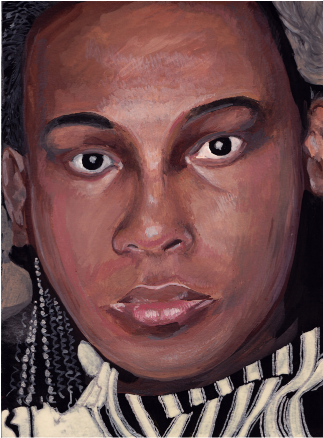
Brice Dellsperger, Mighty Real , 2023, gouache on paper, 28 x 21 cm.