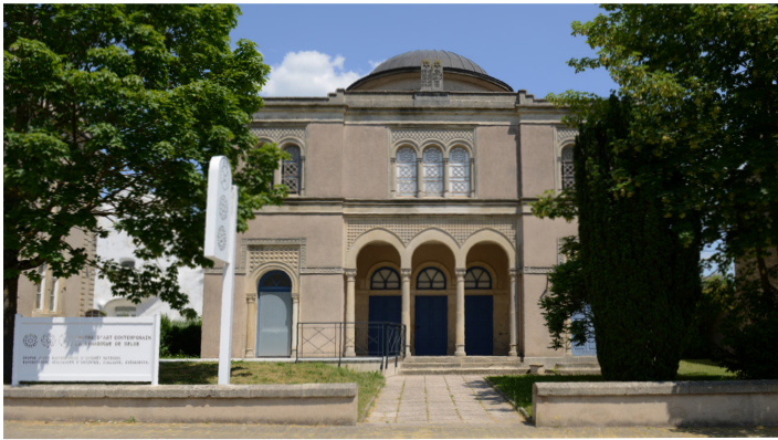
CAC - la synagogue de Delme.